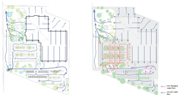
Fig. 3. Module 2: Passive Water Design Baseline and New (Credit students: T. Alaqtum, S. Ghaemi, M. Wilke, K. Chaikunpon, M. Torres)

Demand Calculation: For this module, students complete a site plan, locating various vegetation species throughout the site. To calculate outdoor water demand, the students then use species factors, microclimate factors, and density factors to project vegetation demand. Students fill out LEED credits for outdoor water use with these numbers.