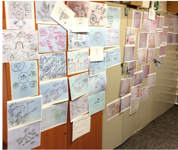
Figure 2. IWMs arrayed on wall for conceptual analysis

At the end of this process, we found five models to be reflected in the content and composition of this set of IWMs: information practices in context [50], sense-making [56], information search process [54], everyday information practices [51], and ecological systems theory [57]. Other major models of information behavior (e.g., [55, 58]) were sought but were not strongly reflected in participants' portrayals of their information worlds. Figure 3 illustrates two maps reflecting selected models: on the left the sense-making journey over time of a mother of twins in a singleton world (as noted previously by McKenzie [59]), and on the right a map invoking an ecological systems model of an information world (previously proposed by Greyson, [60]; O'Brien & Greyson, [61]).