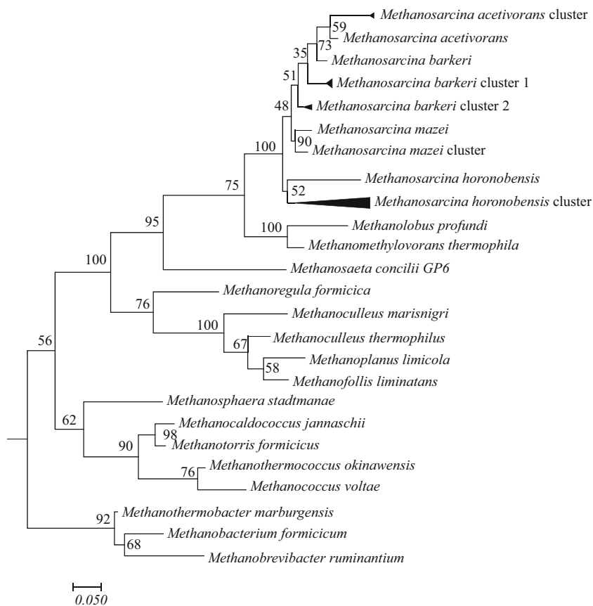
Fig. 2 Phylogenetic tree generated with the maximum likelihood algorithm comparing translated mcrA mRNA transcript sequences to McrA protein sequences from known methanogenic archaea. Bootstrap values were generated with 100 replicates and Methanobacterium formicum , Methanothermobacter marburgensis , and Methanobrevibacter ruminantium were used as outgroups