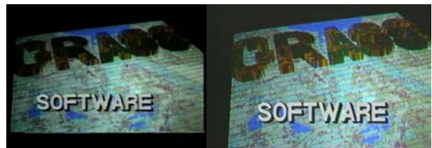
Figure 1: Example of the improved coloring and video resolution of the newly discovered high resolution version of the GRASS promotional video (right) compared to the VHS-version (left).

Visual comparison of the previously known VHS-copy of the GRASS promotional video and newly discovered version show that multiple differences exist. An example is given in Figure 2. At this point it is assumed that the high resolution footage is an earlier edit and predates the VHS-version. An in-depth MFID-based comparative analysis will be conducted once both videos have been published on the AV-Portal.