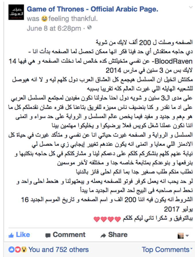
Figure 2. Screenshot of a GoT-OAP post that celebrates reaching 200,000 followers and asks the page followers to design a Facebook cover photo honoring this occasion (posted June 8, 2017).

followers as well as talented volunteers who wanted to join the administration staff, including the Arabic translators of GoT. While we can describe the whole community of GoT-OAP—administrators and general followers—as a strategic audience, by engaged audience I mean specifically those members of the administration staff and loyal followers who contribute to the media production process of the page via, for example, supplying materials and contents. The engaged audience, represented by the administrators, acts as an editorial board in term of monitoring the tone and direction of the page. They are particularly encouraging of general fans' participation when it is connected to the aesthetics/content of GoT. For example, on the recent occasion of the group reaching 200,000 followers, the administrators asked their followers to design a Facebook cover photo for the GoT-OAP celebrating this occasion and the beginning of Season 7 on July 15, promising to publish the best poster along with the name of the winning fan (see Figure 2).