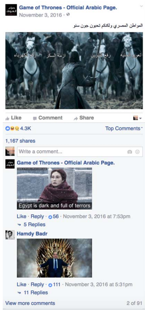
Figure 5. Screenshot of a post that shows Jon Snow facing four warhorses with caption, “The Egyptian citizen, but you love Jon Snow” (posted November 3, 2016).

Kraidy’s (1999) concept of cultural hybridity as glocalization is exemplified in the ways in which GoT-OAP administrators manage censored content on their page. The administrators do not publish sexually explicit or violent scenes from the show, and they monitor posts that connect the themes of GoT to current unrest across the Arab region. Given the political sensitivity of posts such as Figure 3, it is interesting that the rule of keeping fan authors’ anonymity was waived in this case and the posts were published with authors’ names written in English. It is possible that this was an effort to manage accountability for political speech that could provoke negative fallout—directing any such fallout toward the poster rather than the page. However, in other cases such as Figures 4 and 5, GoT-OAP preserves anonymity. In fact, in their coauthored letter, the administrators of GoT-OAP explained that they try,