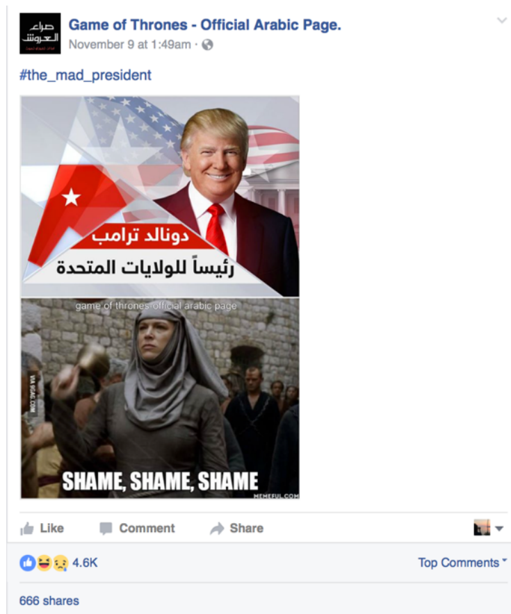
Figure 6. Screenshot of a post that refers to Donald Trump as “the mad president” with pictures of Trump and of Septa Unella chanting “Shame! Shame! Shame!” (posted November 9, 2016).

generally, to avoid posting materials on the page that directly link GoT to current politics, to ensure that followers from diverse political, tribal, religious, and ethnic backgrounds are not offended. They clarified, however, that there are exceptions to this rule, especially “when huge political events occur, we use the series to refer to and comment on such events in a comic style via publishing, for example, comic strips or comic video.” For example, after the U.S. election of Donald Trump, GoT-OAP published several posts like the one shown in Figure 6.