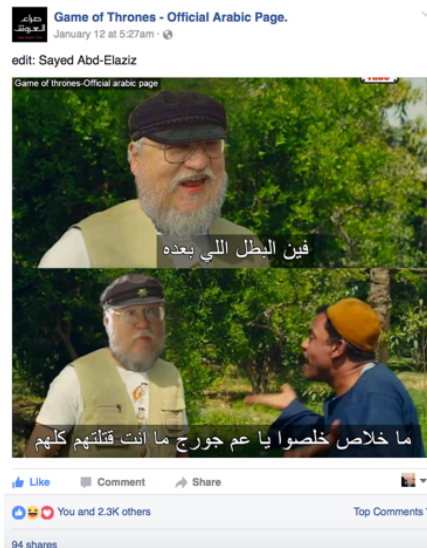
Figure 8. Screenshot of a post that imagines a conversation between George R. R. Martin and an Egyptian fan (posted November 9, 2016).