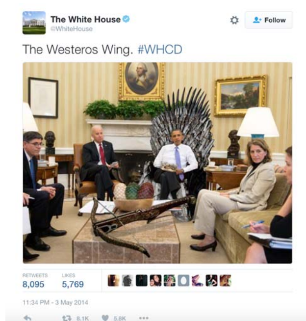
Figure 1. Screenshot of the White House official Twitter account showing Obama on the Iron Throne in an image posted May 3, 2014.