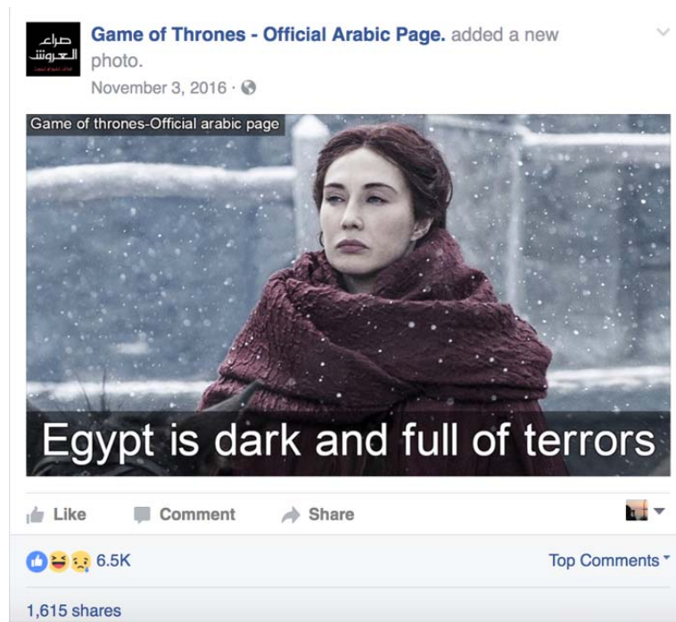
Figure 4. Screenshot of a post that presents a picture of Melisandre from a GoT scene with an edited quote, "Egypt is dark and full of terrors."