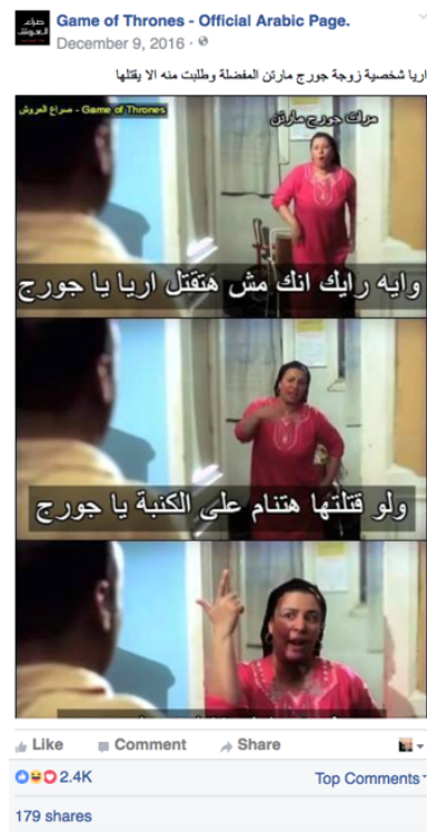
Figure 7. Screenshot of a post that imagines the Egyptian actress Abba Kamel as the wife George R. R. Martin (posted December 9, 2016).