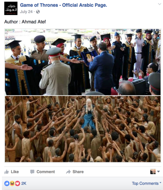
Figure 3. Screenshot of a hybrid image that compares el-Sisi with Daenerys (posted July 24, 2016).

Dislike for Daenerys is often accounted for in the following way: Unlike Arya who goes to Essos as a student (Essos is GoT's imagined geographical version of the Middle East), Daenerys is the female version of the imperial white savior who colonizes Essos. Thus, a negative Arabic nickname of Daenerys ( Ghalizi , which means vapid in the Arabic Levant dialect and rhymes with "Khaleesi" 8 ) is spread specifically among the followers of "Game of Thrones Fans-Syria." While GoT-OAP censors their page from negative comments, the dislike of Daenerys and her nickname Ghalizi can be observed by some commenters occasionally. 9