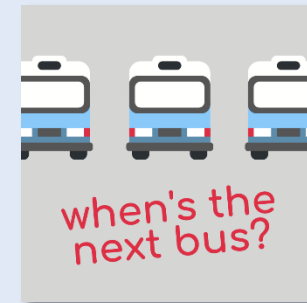
example social media ad promoting safety resources