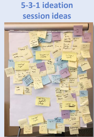
5-3-1 ideation session ideas

grouped together ideas for implementation