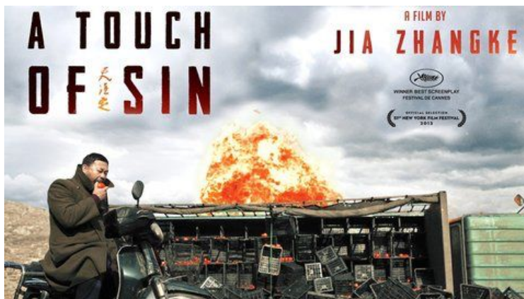
Poster for Behemoth

The other film is Touch of Sin , directed by Jia Zhanke and released in 2013. The film takes place in the form of four different stories from four normal individuals who, after the proverbial straw that breaks the camel's back, engage in ultra-violent