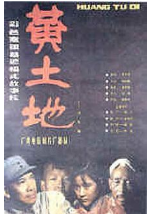
Poster for Yellow Earth

The Sixth Generation developed in the late 1990's. These filmmakers are known for learning their craft primarily from watching pirated foreign films and reading