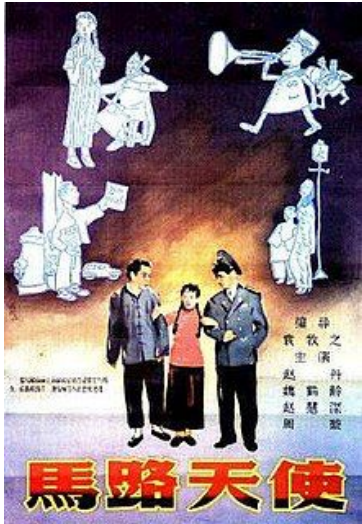
Poster for Street Angel

prostitution. The film was praised for its depiction of lower class and downtrodden Chinese civilians. Stylistically there are similarities between Street Angel and Soviet films of the time. One of the shots in the opening credits seems to give a nod to Battleship Potemkin , showcasing quick cuts in the film of lion statues, an allusion to the lion statues from the famous ‘Odessa Steps’ scene in Potekmin .