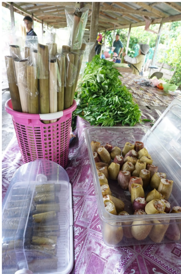
Figure 4 Presentation of glutinous rice snacks prepared inside traditional packaging in Sarawak, Malaysia. At the Kampung Duyoh roadside market, sticky rice was prepared inside Nepenthes ampullaria pitchers (right) and within the leaf and culm of bamboo ( Bambusa spp.) (left).

containers. In an age in desperate need of waste reduction and resource conservation [42], containers like these are a great solution to a growing environmental global problem. Edible packaging trends as one of the top innovations that will change our lives [43], and the buzz around Wikippearl™ shows that consumers desire options that are more eco- and health-friendly.