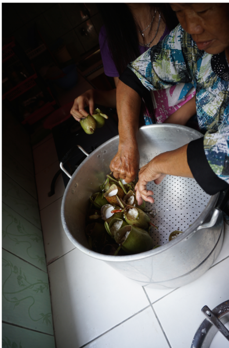
Figure 2 Modern preparation of glutinous rice snack prepared in Nepenthes ampullaria pitchers. Pitchers placed in steamer by indigenous Bidayuh family of Bau, Malaysia.

Another remarkable interview suggests a more historical preparation of the sticky rice snack. One informant took a highland trek with tribal guides who harvested Nepenthes pitchers, coated them in a thick mud and