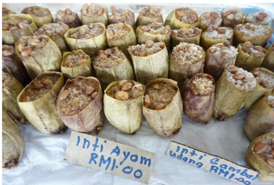
Figure 3 Glutinous rice snack prepared in Nepenthes ampullaria pitchers for sale in Sarawak, Malaysia. This photo shows two variations of the snack made with chicken (left) and prawn chili paste (sambal) (right) with peanuts on top. Each pitcher sells for one Malaysian Ringgit on this Kampung Duyoh roadside market.

Like these, Nepenthes pitchers offer a charming folk packaging that protects the food and has an appeal unmatched by synthetic vessels (Figure 4). In line with their attractive presentation, participants and social media identified that the glutinous rice snack filled inside pitchers were often served to celebrate Ramadan, election parties and harvest festivals. When limitation of serving vessels might otherwise prohibit larger gatherings, pitchers offer an option to feed many people at one time. Nepenthes pitchers are convenient, biodegradable