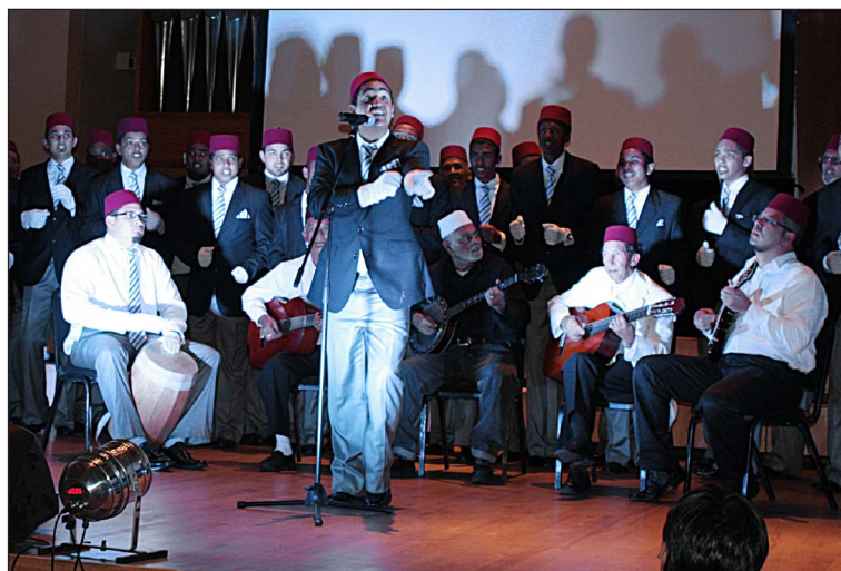
Opening Ceremony The Young Caballeros perform an exciting program.