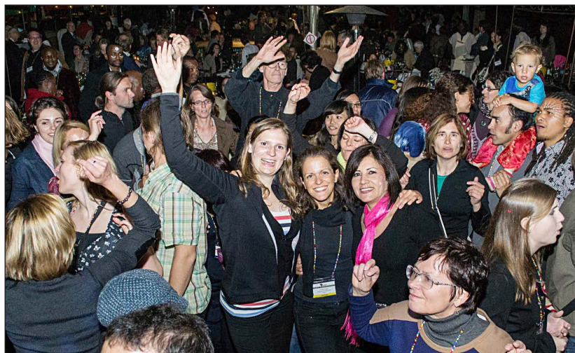
Dinner dance Dance party at the Congress banquet (a crucial IACCP tradition).

As always, the Congress dinner, held on 20 July 2012, was a highlight. Busses transported delegates to the prestigious Spier wine estate on the outskirts of Stellenbosch. In a magical setting amidst the ancient oaks and colonial splendor of the historical Spier Manor House, Moyo, a true African restaurant, offered a unique dining experience. Delegates were treated to an Umdliva buffet dinner consisting of a selection of cuisine flavours from the continent of Africa, prepared at an outdoor kitchen using only the finest ingredients. A further highlight of the evening was the traditional IACCP disco that lasted long into the African night.