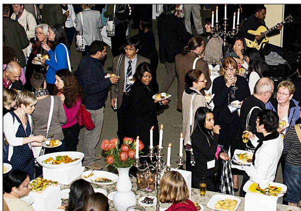
Welcoming At the cocktail party.