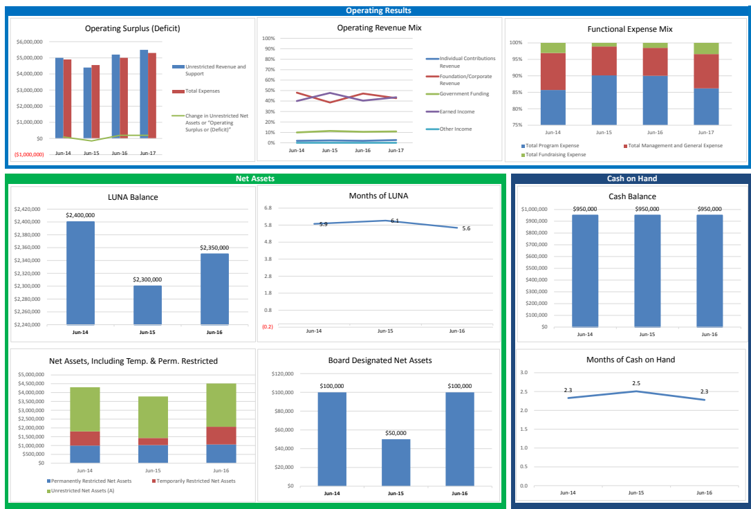
FIGURE 1 Sample Output Dashboard