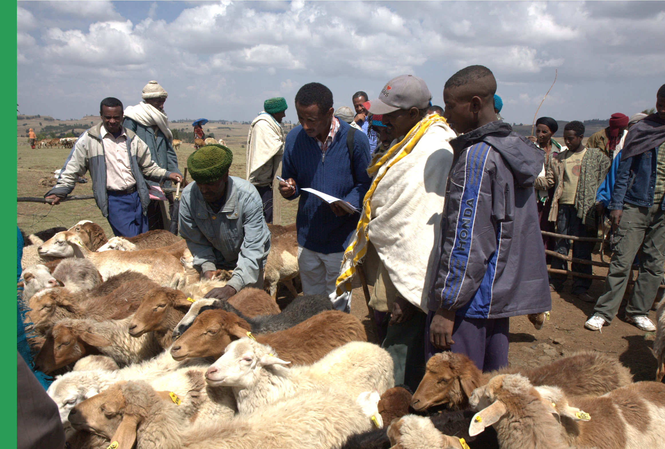
Community members select breeding sires from candidate rams in Menz, Ethiopia.