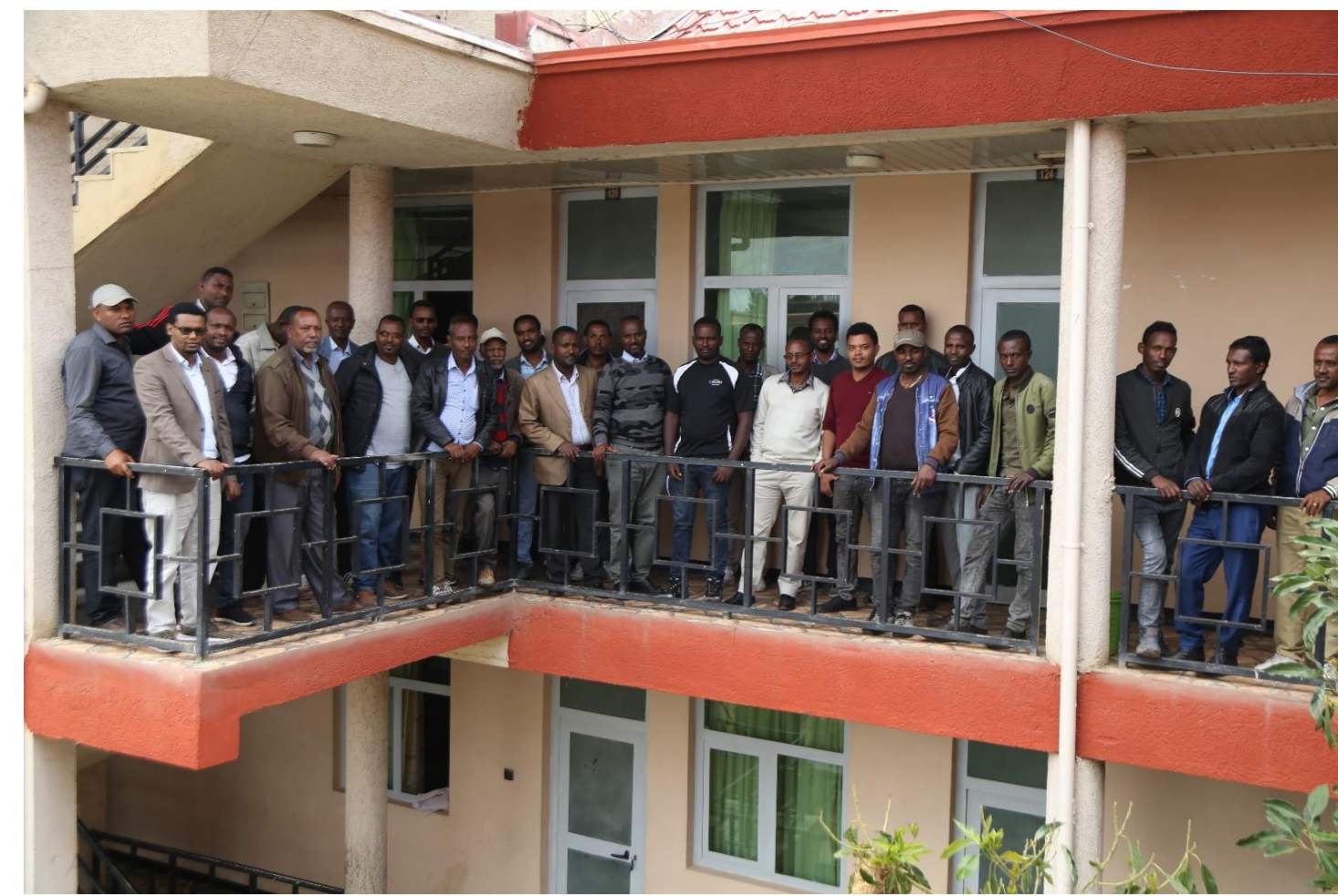
Figure 1. Review and Planning Meetings, Lemo and Robe, May 2019.