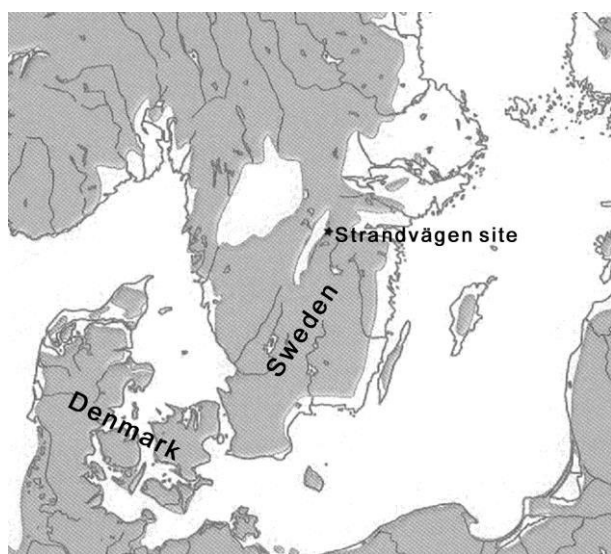
Figure 1 – The location of the Strandvägen site

The site is located on the north-eastern shore of Lake Vättern, the second largest lake in the south of Sweden, at the only outlet of the lake to the Baltic Sea, which at the time of settlement was located about 30 km to the east (fig. 1).