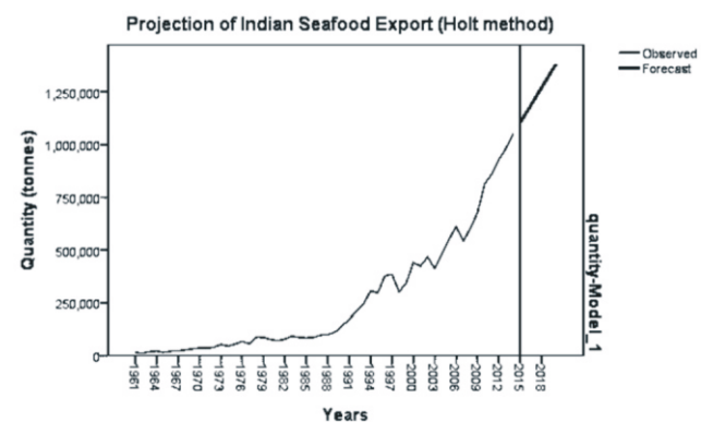
Fig. 2. Indian Seafood export (Quantity) forecast using Holt method