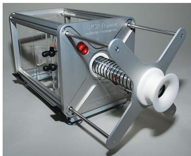
► Fig. 2 The Boškoski-Costamagna ERCP Trainer.