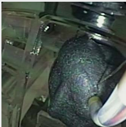
► Video 1 Training sphincterotomy on the synthetic papilla.

Recently, we presented the Boškoski-Costamagna ERCP Trainer, a mechanical simulator for training ERCP [2]. Experts agreed on the didactic strength of the simulator and the added value of this simulator in the training curriculum for novice endoscopists. An important limitation of this model was inability to train on sphincterotomy. Currently, most endoscopists are being trained in sphincterotomy – including their first attempts with the procedure – on real patients. This is not a desirable situation because there is little to no room for mistakes,