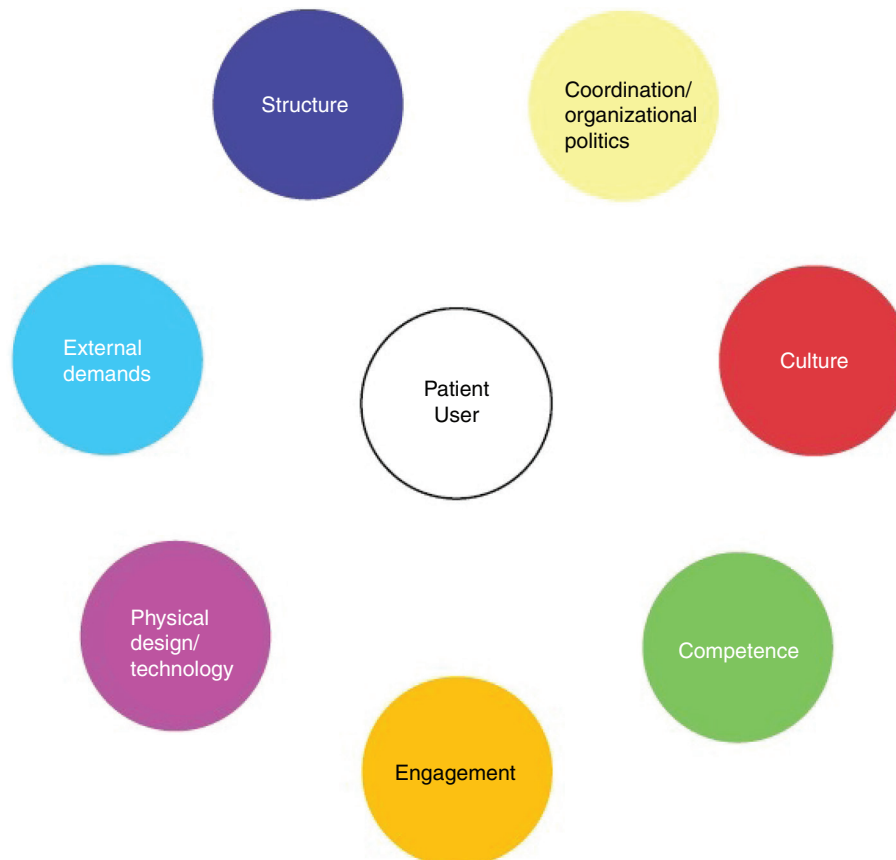
Figure 2 The seven challenges of quality improvement based on Bate et al. 20

The participants in the focus groups had several suggestions for the development of the leadership guide, which were in line with the input received from coresearchers