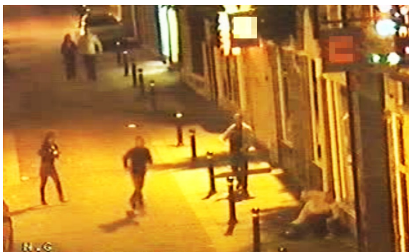
Figure 1b. To the bottom left-hand side, two bystanders leave their standing positions and approach the conflict parties.