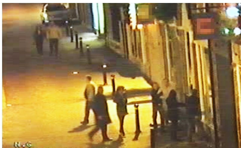
Figure 1c. The two bystanders are joined by others. A male bystander in a dark shirt and jeans pulls the main aggressor from his target, while a female bystander steps between the conflict parties and extends both arms out in a blocking motion.