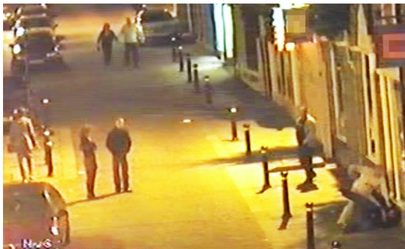
Figure 1a. On the bottom right-hand side, a man dressed in a white shirt assaults another man who is on the ground. Some bystanders observe.