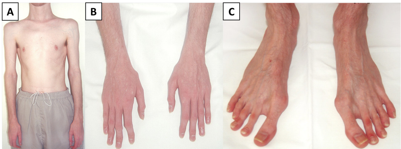
Fig. 2. Physical appearance of the patient with brittle cornea syndrome. (A) asthenic habitus (age 26); (B) hands with clinodactyly (age 26); (C) feet with hallux valgus (age 26).

(Illumina). FASTQ reads were aligned to the GRCh38/hg38 human reference sequence using the Burrows-Wheeler Alignment tool 7 . Variant calling was performed with HaplotypeCaller 8 . Sequence changes with a minor allele frequency <0.005 in ZNF469 and PRDM5 were prioritized for further evaluation. Conventional Sanger sequencing was applied to show segregation of the detected mutation within the family 9 .