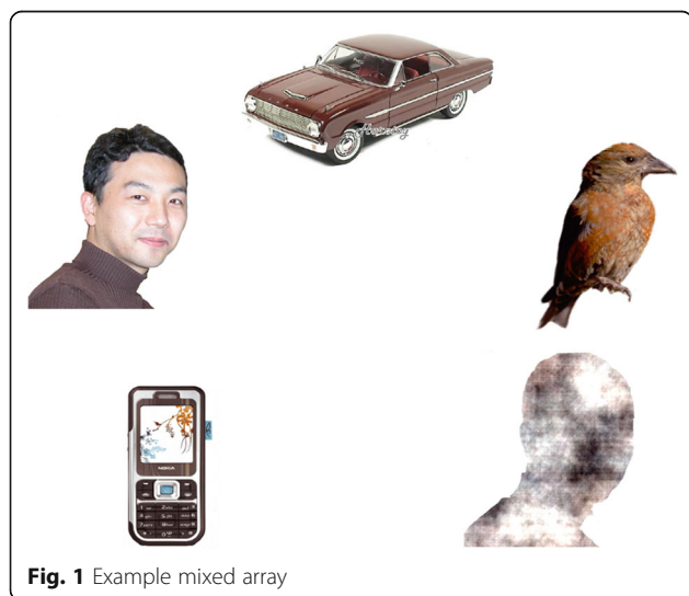
Fig. 1 Example mixed array

The following experimental measures were calculated and are reported in Tables 2 and 3: the total number of first looks to each AOI type as a proportion of all first looks; and peak look duration in each trial, to each AOI type (face, scrambled face and non-social). Peak look duration (i.e. duration of the longest unbroken look to a given AOI) was chosen as the primary metric as it is recommended by Colombo and colleagues as the variable that drives most of the variance in other measures of looking (such as mean look duration and total looking time) and habituation rates during infancy [38], shows robust relationships from infancy to long-term cognitive outcomes [54] and shows good test-retest reliability and consistency across different screen-based tasks amongst 11-month-olds [55]). As children participated in up to 10 trials, peak look durations were averaged across the trials to provide a more stable characterisation of individual differences. For each slide, the peak look in each category (face/scrambled face/non-social) was identified, from a minimum of two looks (> 100 ms). If no peak look was available for a particular category, the trial was