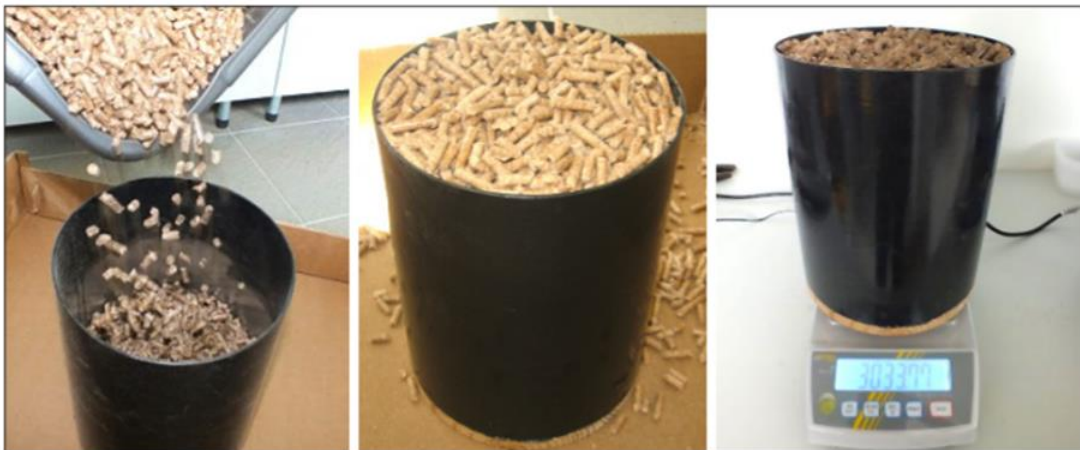
Figure 5. Measurement of bulk density

Bulk density is an important parameter in the transport of pellets. According to MSZ EN 15103, an analytical balance and a standard 5 liter tank are required for testing.