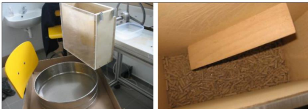
Figure 4. Measurement of mechanical durability

The mechanical durability of pellets is described in MSZ EB 15210-2 standard. The measurement was carried out by the self-developed equipment of the University of Sopron, Institute of Mechanical Engineering and Mechatronics in accordance with the standard. The 500 \pm 10 g pellet, which had to be sieved and weighed on a 3.15 mm perforated sieve, was loaded into the pellet testing apparatus (shown in Figure 4.) and then rotated for 10 minutes at 50 \pm 2 round/min the pattern. After the mechanical rotation, the pellet is filled into the sieve and weighted again.