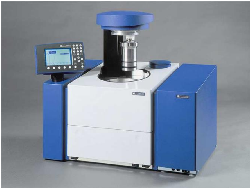
Figure 1. IKA-C 2000 type Calorimeter

Ash content is an important for energy aspect, and it is also important for firing equipment design. The ash content of wood pellet is low, usually below 0.5 %, while agri pellets from herbaceous plants have a higher ash content of about 3 to 10 %. The ash content was determined by muffle furnace test. From a firing point of view, moisture content is one of the most important properties, since it is closely related to the heating value [13]. Determining the moisture content is also important because of the pelletization, if the wet content is too high or too low, the pellet will breaking and fall apart.