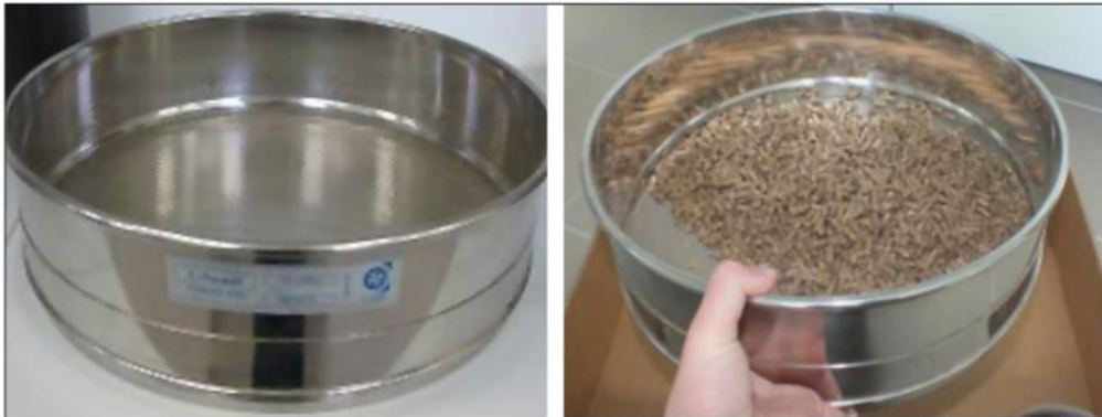
Figure 3. Determining the fine proportion by sieving

From a sample of about 1.2 kg, the sieve is used to manually remove the crumb by a few circular movements, which can be calculated with the following formula: