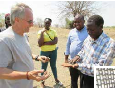
(Above) Farmers, extension and researchers explore soils; (right) Farmer-buyer negotiations informed by flock dynamics.