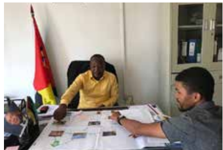
Farmer and government representatives illustrating their perception of change in the stakeholder network.