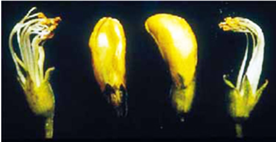
Fig. 4 Cleistogamous anthers and flower bud (left) compared with that of a normal cultivar (right)