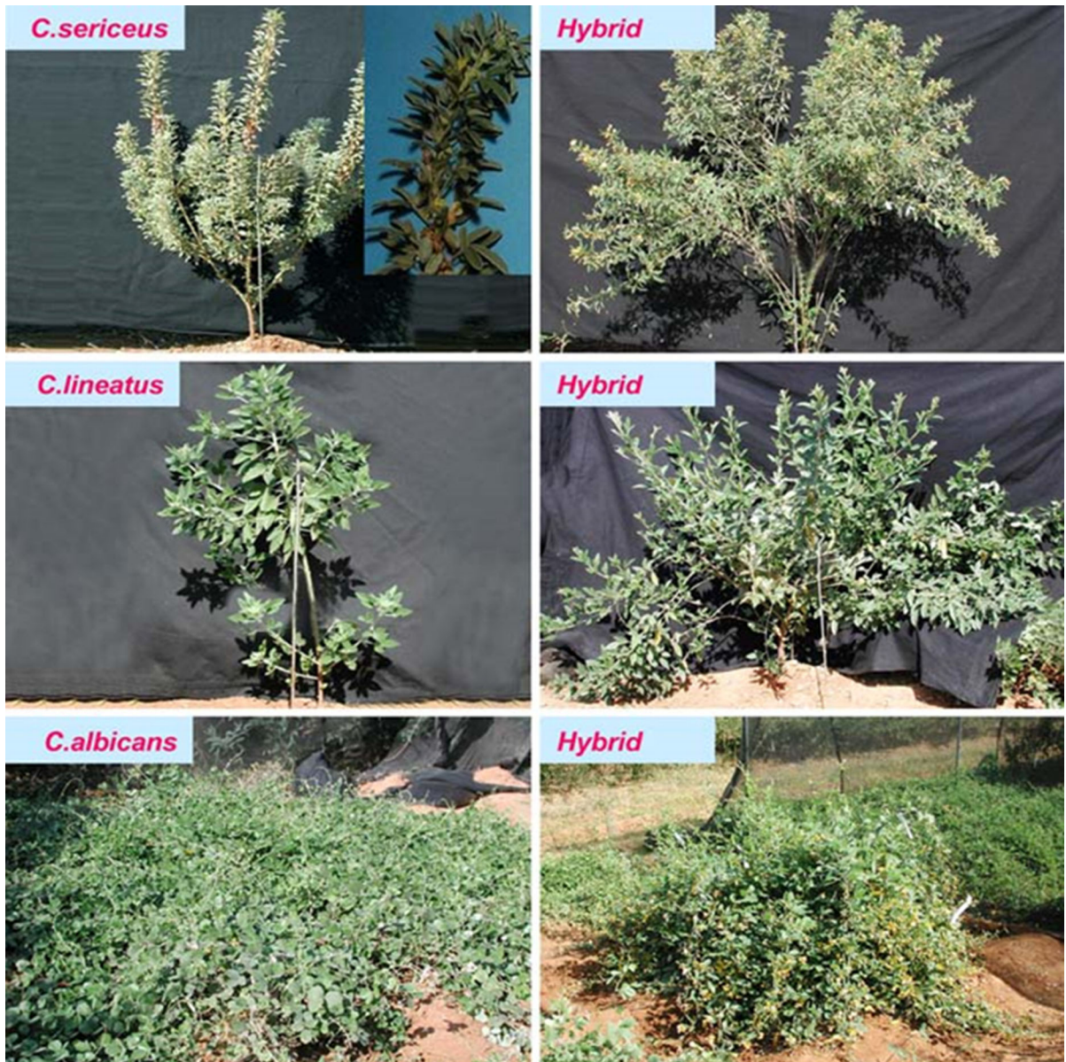
Fig. 2 Three wild species (left) and their natural hybrids (right)

Progenitor of Cajanus cajan /domestication