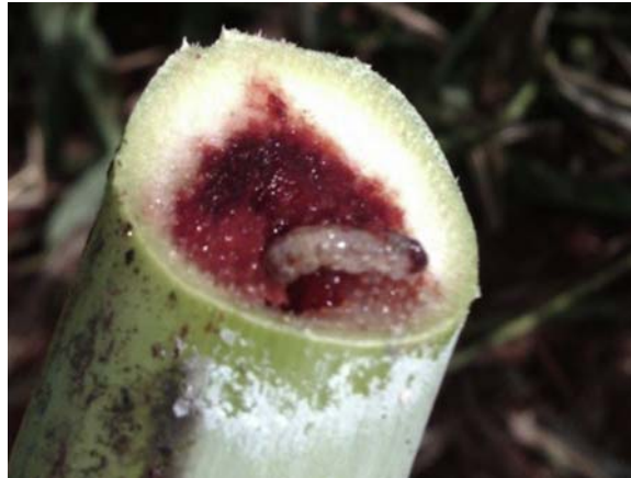
FIGURE 16.3 Stem borer–infested sweet sorghum stalks.