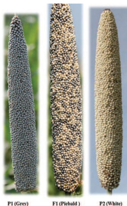
Fig. 1. Representative panicles showing the segregation for grain colour in F 1 hybrid (center) derived from a cross between a grey colour grain female parent (P1) and a white colour grain male parent (P2)

parental lines were planted in single row plots of 4 m length replicated two times in a randomized complete block design (RBD) during the summer and rainy season of 2009 in Alfisols at ICRISAT, Patancheru. Hybrids and parental lines were planted in separate strips side-by-side. All these plots were planted with a spacing of 60 cm and 75 cm between rows in summer and rainy season, respectively. The seedlings were thinned at 15 days after sowing to maintain one seedling per hill at a spacing of approximately 10 cm in both summer and rainy season. Basal dose of 100 kg of DAP (Diammonium phosphate, contains 18%N: 20%P) was applied at the time of field preparation and 100 kg ha -1 of urea (46%N) was applied as side-dressing after the thinning. Ten random plants in each plot were selfed at the panicle emergence stage. These were harvested at maturity, sun dried for 15 days, and hand threshed to produce bulk grain samples from each plot. Since white grain colour is dominant over grey grain colour and expressed as xenia effect, after crossing grey female lines with the white male lines, all the crossed seeds (F 0 ) in female panicles were completely white. Therefore, the grains on the F 1 plants segregated for white and grey grain colour in the same panicle (Fig. 1), which was manually separated into two grain colour classes for Fe and Zn analysis.