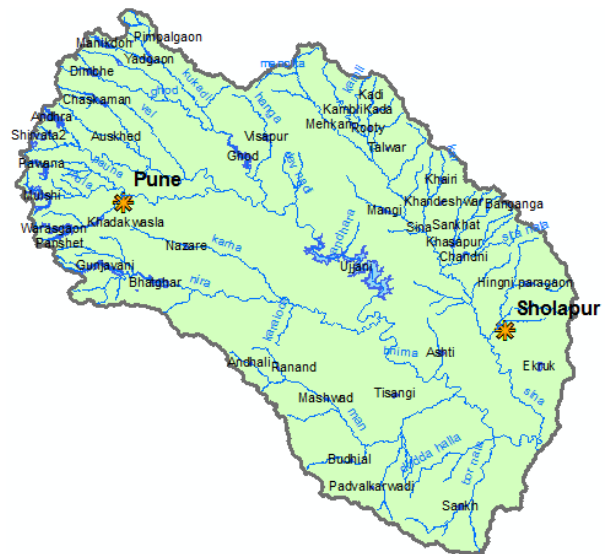
Figure 1. Upper Bhima Catchment

The framework developed for the Upper Bhima catchment (Figure 1) draws on previous hydrologic-economic projects (George et al. 2007). The aim of integrating these constituents is to analyse plausible water sharing scenarios in the basin and to better understand the impacts of future actions. This integrated approach to analysing water allocation can provide policy-makers with a tool that allows them to enhance their decision making capacity. Furthermore, this framework could be used as a template for future evaluations of similar projects, regardless of scale.