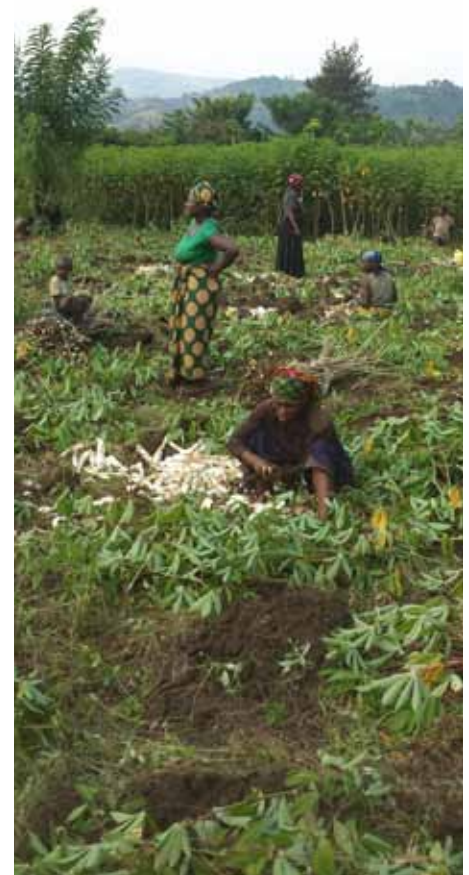
Wondering cassava farmers.