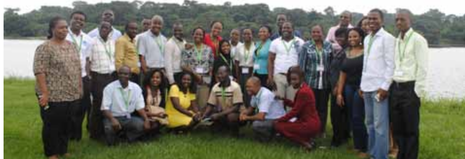
Participants at the IITA lake side in Ibadan.