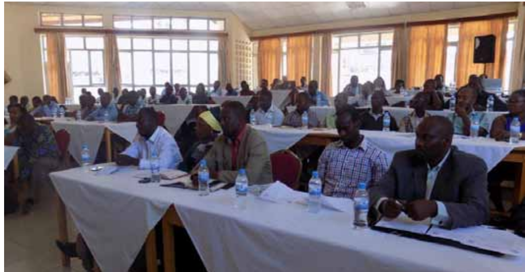
Cross section of participants during the workshop.

As an emergency response to CBSD, the Ministry of Agriculture and Animal