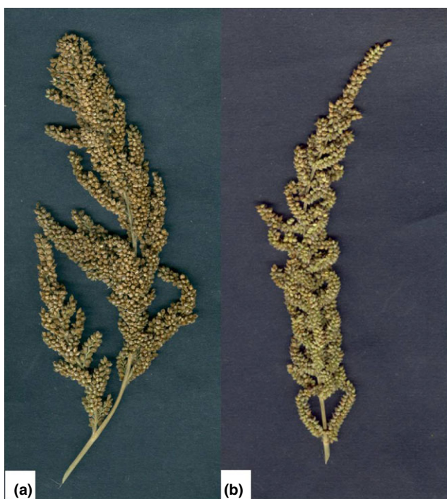
Fig. 1: Panicles of two cultivated species of barnyard millet (a) Echinochloa esculenta (b) Echinochloa frumentacea

branching, more compact growth habit, larger inflorescence, reduced shattering and larger seed size. Yabuno (1975) considered low seed shattering, lack of seed dormancy, thick culms, wide leaves and round spikelets in E. esculenta were the main characters selected by man during the process of domestication. This suite of traits that constitutes 'domestication syndrome' for closely related foxtail millet (Defelice 2002, Doust et al. 2005, Li and Brutnell 2011) and pearl millet (Poncet et al. 1998, 2000) is likely for barnyard millet as well. Increase in seed size in Japanese barnyard millet during domestication is suggested by archaeological data. The mean size of Echinochloa caryopses from the Middle Jomon period (3470 B.C.E.–2420 B.C.E.) was about 20% larger than specimens from Early Jomon period (5000 B.C.E.–3470 B.C.E.), indicating that selection for larger seed size was taking place over several millennia in Northern Japan (Crawford 1983, 2011, Takase 2009). The cross-compatibility between domesticated barnyard millet and their ancestral forms and the existence of naturally occurring intergrades between the two forms provide avenues to understand the mechanisms driving domestication and elucidate the genetics of domestication traits in this crop.