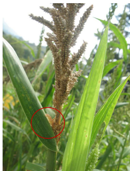
Fig. 4: Stem borer and its damage in barnyard millet

Barnyard millet grain requires dehulling prior to making it suitable for human consumption (Lohani et al. 2012). The dehulling is conventionally performed by repeated pounding in mortar, which is time consuming and also labour intensive as the grains