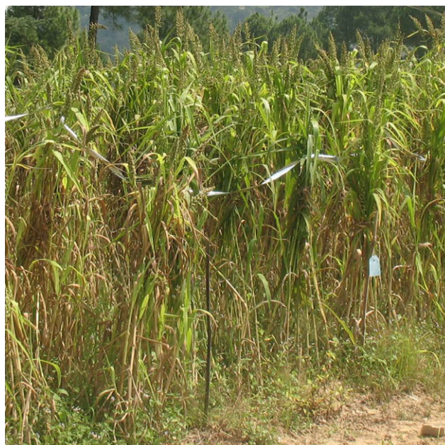
Fig. 2: Barnyard crop trial at VPKAS, ICAR, Almora, Uttarakhand, India

The flowering starts from top of the inflorescence and moves downward completing in 10–15 days. Flowers open from 5 to 10 am with maximum number of flower opens between 6 and 7 am (Sundararaj and Thulasidas 1976, Jayaraman et al. 1997). In the individual raceme, the flowering first starts at marginal ends and then proceeds to the middle of the raceme. The flowers are hermaphrodite (have both male and female organs). Before the anthers dehiscence, the stigmatic branches spread and flower opens (Seetharam et al. 2003). Late season florets are cleistogamous (not opening) (Maun and Barrett 1986). It is primarily self-pollinating (Maun and Barrett 1986, Potvin 1986, 1991) and self-compatible (Maun and Barrett 1986). Some degree of outcrossing recorded which was facilitated by wind pollination (Maun and Barrett 1986). Hot water treatment of inflorescence at 48°C for 4–5 min (personal observation) was effective in inducing male sterility under hill condition in both the cultivated species.