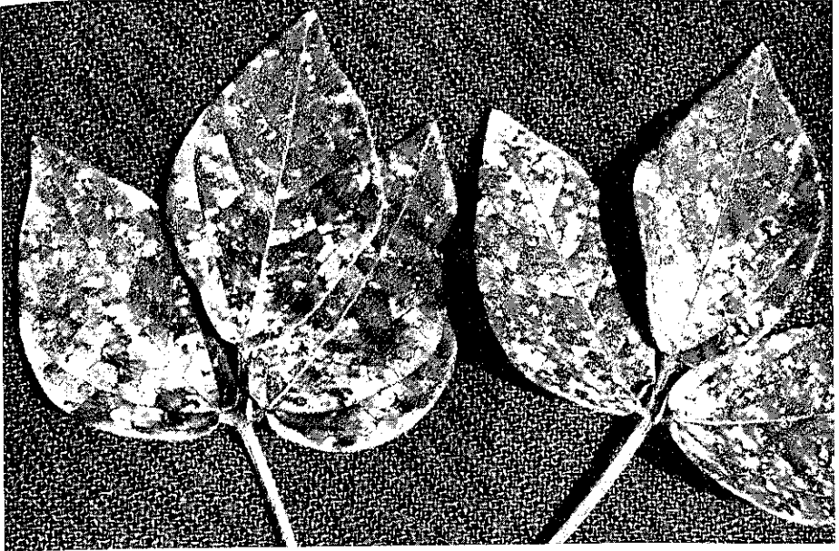
Fig. 1. Symptoms of yellow mosaic on horsegram leaves