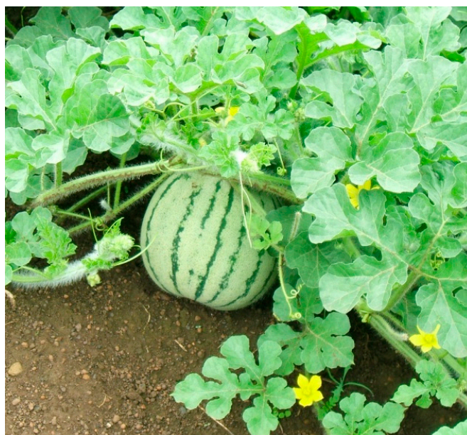
Figure 9. Wild watermelon. Source [10].

Wild watermelon has a long history of cultivation and is grown throughout the world as a staple food (edible seeds and flesh), and for animal feed [109,110]. The rind is utilised for products such as pickles and preserves as well as for extraction of pectin [111,112], whereas seeds are a potential source of protein [110,113] and lipids [114]. The fruits are a popular and important source of water in the diet of the indigenous people in the Kalahari Desert during dry months of the year when no surface water is available.