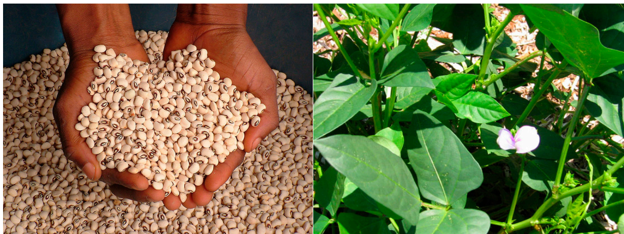
Figure 6. Cowpea seed ( Left: black-eyed cowpea) and a cowpea plant ( Right ) at the flowering stage of growth. Source [10].

make it an important crop for inclusion in food and nutrition security as well as climate change adaptation strategies for SSA.