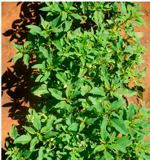
Figure 7. Amaranthus cruentus . Source [10].