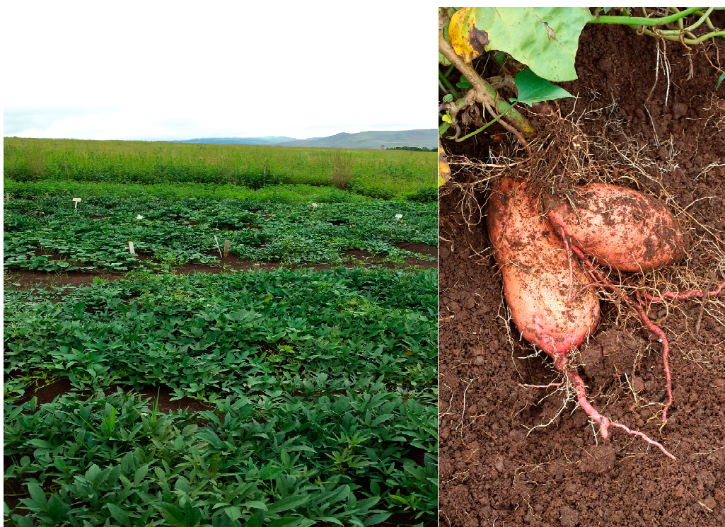
Figure 3. Sweet potato.

Although sweet potato ( Ipomoea batatas ) (Figure 3) is among the earliest first staple crops domesticated by man prior to the introduction of cereal, it still remains one of the NUCS. Together with cassava, sweet potato, yams and aroids are important crops within developing countries [61]. Early Portuguese explorers are believed to have first introduced sweet potato to Africa in the 16th century [61]. Since then, it has spread throughout the continent. It is commonly referred to as the ‘poor man’s crop’; this negative perception may, in part, explain its current status as a NUCS.