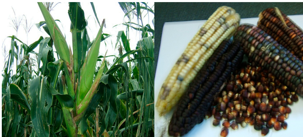
Figure 1. Maize landraces still show much variation with regard to seed colour and ear prolificacy. Source [10].