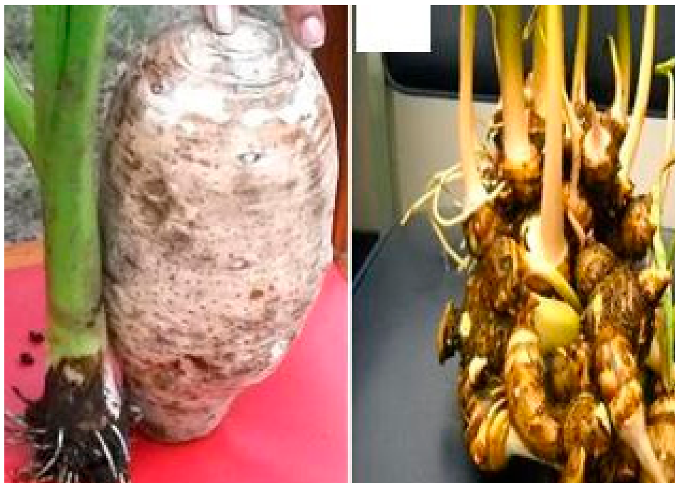
Figure 4. Taro landraces: (Left) Var. esculenta —dasheen with one main corm and a huli used as planting material and, (Right) Var. antiquorum —eddoe with numerous side cormels. Source [10].