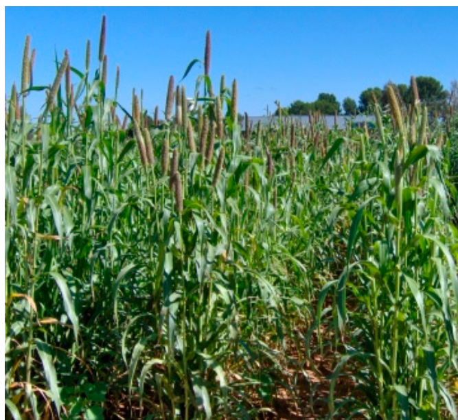
Figure 2. A crop of pearl millet.

Millets (pearl, foxtail and finger millet) are an example of indigenous cereals grown in the dry parts of SSA. These crops may have been indigenised to the dry areas due to many years of cultivation, as well as natural and farmer selection. However, now the production of millets is limited to certain areas that are not considered as cereals producing areas in SSA [51]. Across much of SSA, cultivation of pearl millet (Figure 2) is mainly practised at a subsistence level by smallholder farmers. It is only grown commercially as forage for animal consumptions in some areas [52]. Millets are an annual C4 plant that can grow on a wide variety of soils ranging from clay loams to deep sands but the best soil for cultivation is deep, well-drained soil. This makes it suitable for cultivation by smallholder farmers in semi-arid areas where deep sands and sandy loam soils dominate. In addition, millets are easy to cultivate and can be grown in arid and semi-arid regions where water is a limiting factor for crop growth [53,54].