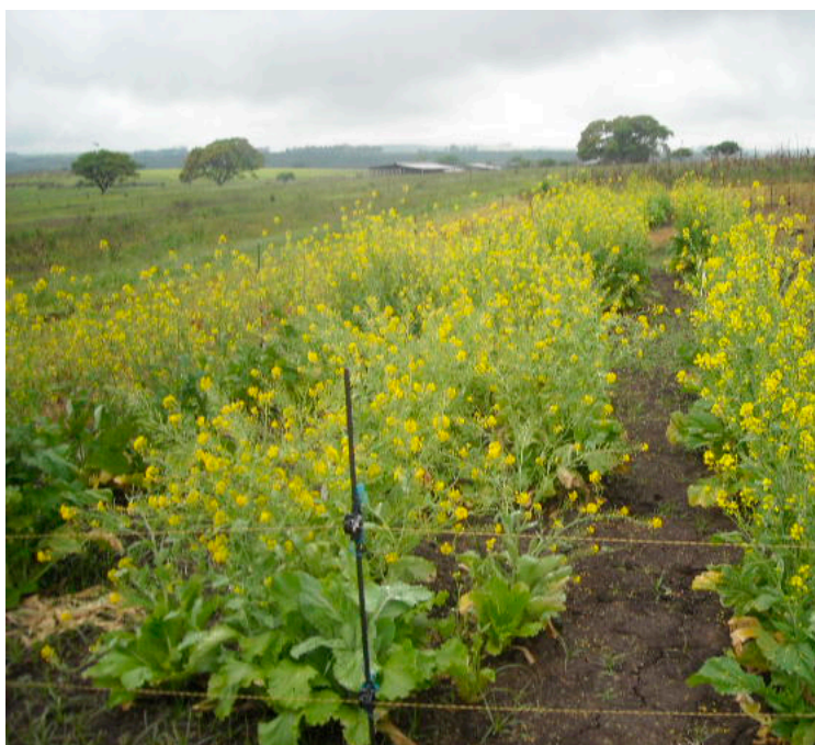
Figure 8. Wild mustard landraces.

Wild mustard [ Brassica juncea (L.) Czern & Coss and Brassica nigra (L.) W.D.J. Koch] (Figure 8) is an indigenous leafy vegetable of South Africa and belongs to the family of Brassicaceae or Crucefereae [101]. It is cultivated under diverse environmental conditions and is of great importance to the nutrition and livelihoods of SSA's rural population. Wild mustard, like many other African leafy vegetables, provides essential vitamins, trace elements (iron and calcium) and other nutrients that are important for good health [102]. The seeds also have high oil and protein content [103], although this is dependent on environmental conditions [104].