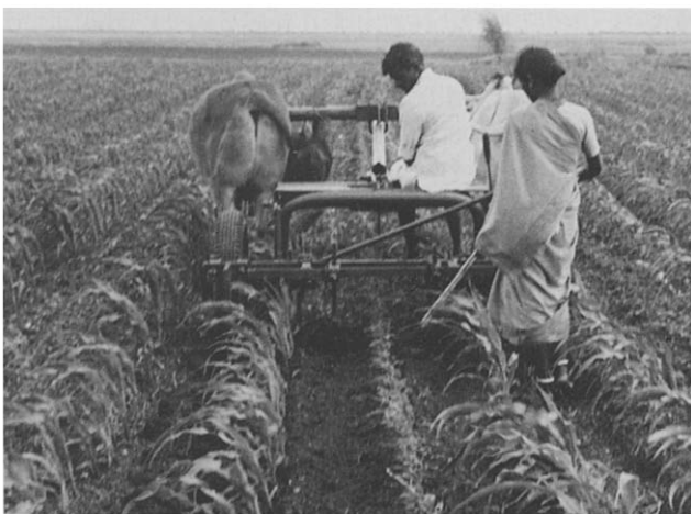
Fig. 1. An animal-drawn wheeled tool carrier (WTC) in use for interrow weeding.

In order to obtain precision and timeliness for farm operations, a wheeled tool carrier (WTC) based animal-drawn farm machinery was developed. The WTC (Fig. 1) described in detail elsewhere (Bansal and Srivastava, 1981; Bansal and Thierstein, 1982) can perform various field operations by attaching appropriate implements to a toolbar at the rear of the machine. The WTC, usually pulled by a pair of oxen, provides flexibility for making suitable ad-