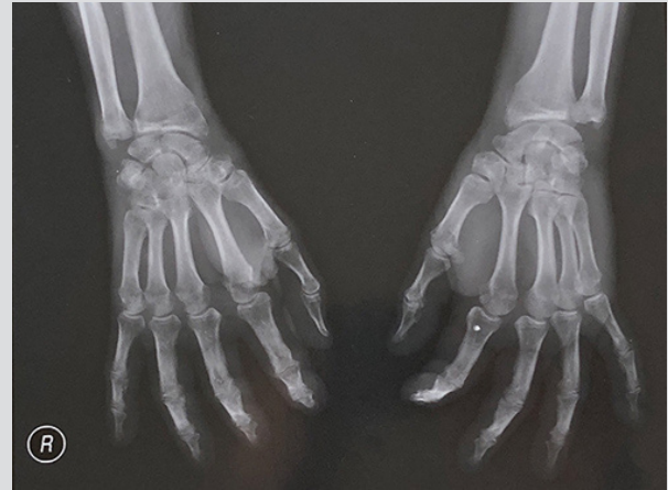
Figure 2. Plain x-ray of both hands

The clinical diagnosis of RS3PE was suggested and the patient was prescribed prednisolone 15 mg daily. All previous signs and symptoms resolved after 1 week. Haemoglobin values remained at 11 g/dl, but the ESR and CRP normalized to 5 mm/h and 0.27 mg/dl, respectively. In order to exclude an underlying malignancy, a chest abdomen pelvis (CAP) computed tomography (CT) scan was performed and revealed a mass in the caecum measuring 29×19×32 mm (posteroanterior×transversal×longitudinal axis) and a contiguous 7 mm lymph node with high contrast enhancement, but no other anatomical changes (Fig. 3). Colonoscopy confirmed a vegetant mass in the caecum encompassing the ileocaecal valve. Biopsy of the mass revealed a low-grade adenocarcinoma. Serological levels of carcinoembryonic antigen were normal (1.8 ng/ml).