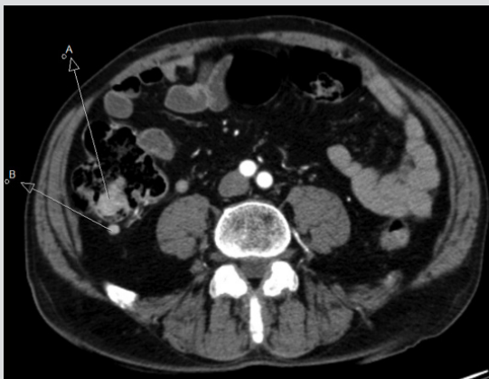
Figure 3. CAP-CT, August 2015: (A) tumour of the caecum; (B) lymph node

After 3 years of follow-up there was no evidence of neoplastic relapse (Fig. 4) or RS3PE syndrome.