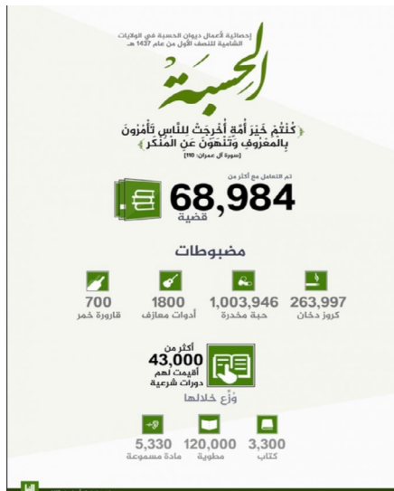
Graphic 1: “Statistics of Diwan al-Hisba in Sham provinces for the first half of 1437” al-Naba’ no. 30

Therefore, as this analysis has tried to show, even if statistics in the infographics are correct, they leave out key problems that change the picture regarding the capacities of these services and institutions. While extreme violence projects one facet of state power, the incompleteness of the Daesh ‘state’ renders it unable to fulfill other basic functions, which also include stable currency production or passport generation. In both of these respects Daesh remains dependent on other states, primarily Syria and Iraq. Daesh cannot manage a modern economy if it cannot print an internationally recognized currency through a central bank. Since the infographics under discussion here were published, Daesh has also lost significant territory, falling further from full statehood and struggling to hold onto what little remains. Daesh media attempt to elide this weakness with displays of strength, dominance, and competence, but the ‘Islamic State’ will remain an incomplete state at best even if it regains territory.