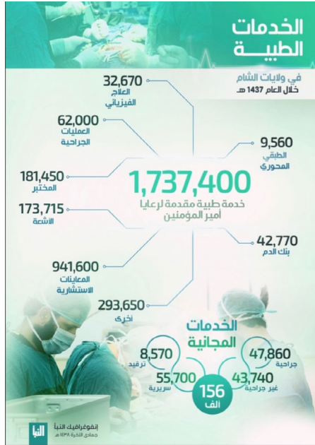
Graphic 4: “Medical Services in Sham Province for the year 1437 hijri” al-Naba’ no. 70