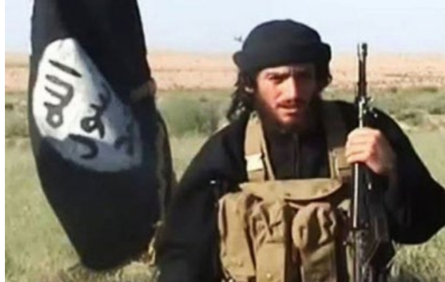
ISIS spokesman Shaykh Abu Muhammad al-Adnani ash-Shami

The intimate public thrives by creating an emotional connection that produces a sense of relief and an answer to the persistent internal struggles of individual recruits.