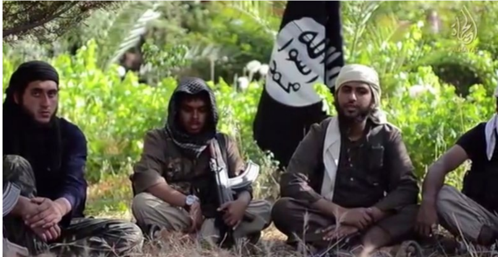
Screen grab from video 'There is No Life Without Jihad'

An “intimate public” exists in a juxta-political safe world where various narratives are transformed into one.