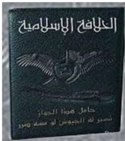
Figure 2. Purported real Islamic State passport.

Besides being a juridical and functional artifact of sovereignty, a passport is a material canvas for power to demonstrate its legitimacy. This gives it an analyzable communicative pertinence. In the first instance, the decision to issue a passport is a declaration of having borders that demarcate national territory and is a geopolitical statement of inclusion among the larger community of nations. It matters for burgeoning international relations since a country's official travel papers derive currency from other countries' formal recognition of the authority vested in them. Perhaps, since IS saw its borders as fluid and did not recognize other states, it had no such purpose for national documents.