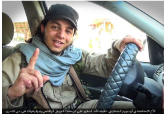
Daesh eulogy image

martyrdom narrative that transforms an on-ground defeat into a symbolic victory, guided by “a sovereign imaginary that demands death over disobedience.” By disseminating more eulogy images when facing direct blows, not only did Daesh reframe the battle, but it also attempted to boost its moral superiority among its followers online.