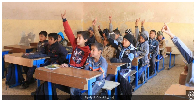
Images of beauty and normalcy purporting to be Mosul & environs