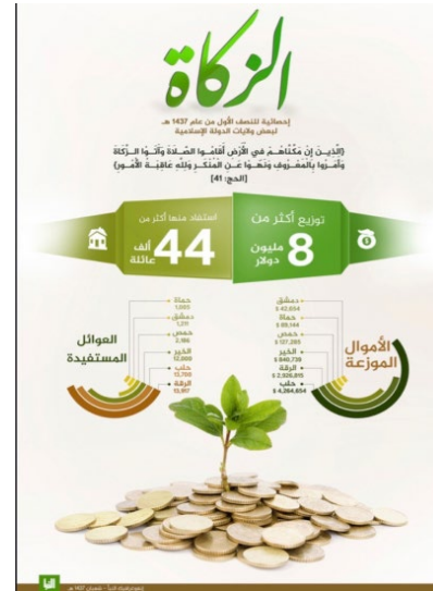
Graphic 6: “Statistics for the first half of 1437 for some provinces of the Islamic State” al-Naba’ no. 31

Infographics about statecraft seek to prove wrong those who doubted Daesh, while reinforcing the paternal and nurturing aspects of the state.