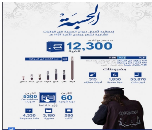
Graphic 8: "Statistics of Diwan al-Hisba in Sham provinces, month of Jamadi al-akhra of 1437" al-Naba' no. 24

Religious governance in territories controlled by Daesh falls under al-Hisba , the religious police, and various infographics in al-Naba' attempted to quantify its effectiveness. Daesh shari'a courts in Syria processed just under sixty-nine thousand cases in the space of six months. (Graphic 1) A graphic focusing on a one-month span in Syria showed that the majority of the Syrian cases were in Al-Raqqqa. (Graphic 8) For this period between March and April of 2016, we get the most detailed breakdown: 31% of these cases are described as related to buying or selling during prayer times, 13% related to drugs or smoking, many to "various infractions" like wearing makeup or failing to veil the way Daesh decreed. Daesh claimed to have seized more than one million pills during a six-month period in Syrian provinces, as well as several hundred thousand cartons of cigarettes. (Graphic 1) Remarkably, Daesh quietly tolerated cigarette smuggling and later seized the profits from the smugglers themselves, as another source of revenue in hard times—the theme of controlling vice was quietly superseded by hard financial need. Still, the latent theme of infographics relating to religious vice, even if hypocritical, is that stability through rule of law is one of the most tangible benefits Daesh can offer after years of chaos.