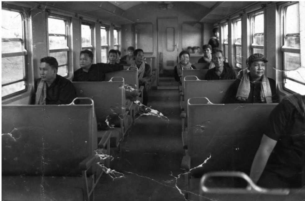
Khmer Rouge leaders sit in a train car in 1975; Pol Pot is on the far left.

The Islamic State also attacks and disrupts mainstream notions of time and the temporal. So, too, did the Khmer Rouge, a rebel Cambodian cabal led by the despot Pol Pot, who seized control of the capital city of Phnom Penh on April 17, 1975 and declared “Year Zero,” a reset of time, history, and the outside world. The Khmer Rouge platform was built on an oversimplification of history that laid blame for the nation’s struggles at the feet of its Western colonizers; by re-setting the clock, the revolutionaries contended that they could throw off the organizing system of their foreign oppressors. All holidays more than seventeen years old were forgotten; all schools were closed; most intellectuals were killed. The goal was to reconstruct each individual, atomized citizen from the ground up, convincing them that they inhabited a time before colonial oppression, when the great Twelfth-Century city of Angkor Wat—the nation’s apogee—was more than a ruinous reminder of a glorious past.