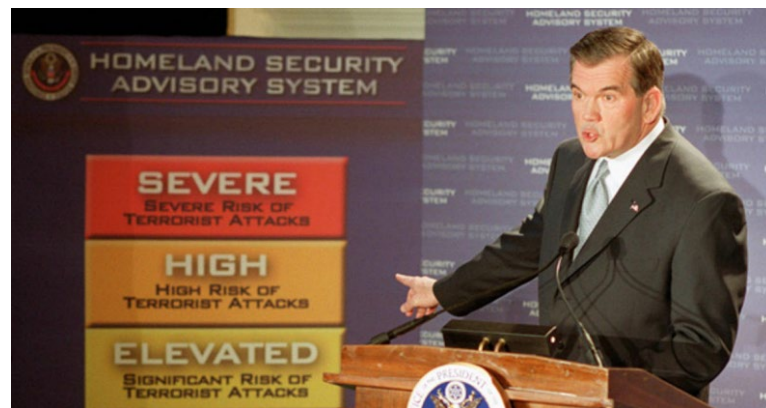
Homeland Security Secretary Tom Ridge -- March 2, 2002

harnesses the fears of the public, it also “invites us to be involved in managing the terrorist risk as a logical step towards ensuring our own safe keeping.” 4 Discourses encouraging citizens to play an active role in ensuring their security through self-monitoring and self-discipline are not unique to this historical moment. But the ways in which this is implemented is consistent with broader societal trends towards individualization and responsabilization under neoliberalism. In such formations, individuals rather than the state are primarily responsible for dealing with risks of all kinds and can be held accountable if they do not play their part.