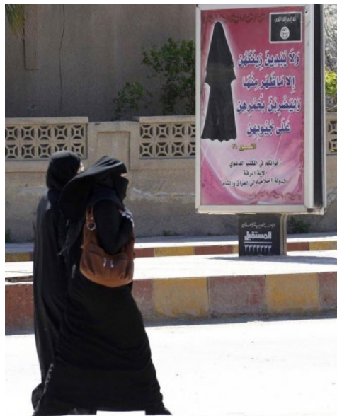
ISIS billboard with verse from the Qur’an urging women to wear hijab. Raqqa, Syria, 2014.

To begin with, it is important to note that IS is at once a juxtaposition of the modern and the medieval, combining modern techniques and technologies of rule with medieval discourses and practices of power. Sifting through the pages of Dabiq , an online magazine that IS produced between July 2014 and July 2016 in such languages as English and French and targeted mostly at audiences outside IS territories, the picture that emerges of IS’s treatment and view of women—with respect to their behavior, role, and status in private and public spheres—bears the hallmarks of a biopolitical power. A biopolitical power is a broad designation that for the purposes of this essay combines elements of both Michel Foucault’s and Giorgio Agamben’s definitions and interpretations of the concept involving practices of biopower, disciplinary power, and sovereign power.