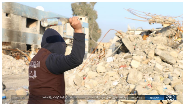
Hisba agent destroying a bottle of alcohol

The battle over east Mosul showed that military pressure did not eliminate Daesh's propaganda during the first four months. Whereas military pressure hindered the production and dissemination of some visual frames, such as combat and war spoils, the dissemination of other frames, such as eulogy and law enforcement, ramped up amid intensified pressure. Daesh utilized eulogy as a narrative of ultimate victory, bringing destruction to the enemy, and happiness to the "martyr" in this life and the hereafter. By doing so, Daesh abandoned