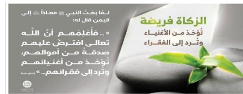
Graphic 7: “Zakat is Obligatory” al-Naba’ no. 46