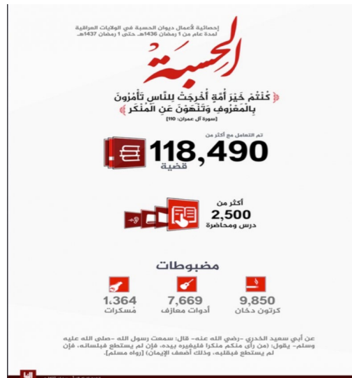
Graphic 2: “Statistics of Diwan al-Hisba in Iraqi provinces for full year from June 2015-June 2016” al-Naba’ no. 37