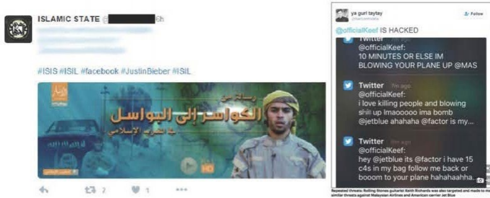
Image 2. #JustinBieber, and Image 3. Keith Richards -- account hacks

In an interesting twist on persona poaching, a number of highly publicized counter-ISIS hashtags have emerged, like the ones below (See Images 4 and 5). Of course, as the saying goes, on the Internet nobody knows if you're a dog, so issues of (re)presentation, authenticity, and validity haunt all digital practice and research (Kraidy, 2012), particularly when accounts and users are suspended, anonymized and frequently resurrected. ISIS' online presence is largely a spectacle precisely for that reason—it is a reflection and a refraction of reality without necessarily being attached to a direct referent.