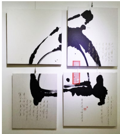
Mongolian calligraphy

The Islamic State employs a similarly malleable strategy. The “Islamic State’s decision-making is opportunistic, adaptive, and dependent upon its leaderships’ [sic] shifting propensity to implement its ideology,” one analyst, Craig Noyes, writes, suggesting that the group, which purports to embrace the doctrinally rigid Jihadi-Salafist sect, is actually more adaptable than it tries to appear. “[I]t is only when Islamic State has adequate governing strength, or a decision cannot provide short-term organizational benefit, or IS’s ideological legitimacy and grand strategy are at stake that it pivots to overtly ideological decision-making.” 1 The Islamic State has collaborated with non-Islamist groups for tactical maneuvers and propaganda purposes, all in the service of war-making.