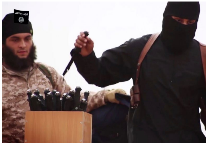
Mohammed Emwazi ("Jihad John"), ca Nov. 16, 2014.

In the case of ISIS, the use of (Western, corporate) social media to organize and spread its message, as well as the usual terrorist logic of co-opting media practices to spread fear, are central to the successes that ISIS has achieved. While news media circulated images of the group's acts of brutality, popular figures on social media emphasized the freedom and glory of life in the caliphate to attract foreign recruits to Syria. The openness and decentralization of ISIS propaganda, and its ease of access on common social media platforms, further encouraged followers to commit acts of terror in their home countries, multiplying and creating risks everywhere. ISIS documents promoted "Media Jihad" as central to its strategy, and other articles in this series have explored ISIS' use of hashtag hijacking on Twitter and its visual propaganda techniques.