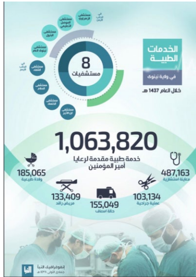
Graphic 3: “Medical services in Ninawa Province in the year 1437” al-Naba’ no. 69

public “media points” where citizens could access all of the group’s digital productions—in short, to make the propaganda it spread online reach more of the audience on the ground inside of war-ravaged Iraq and Syria. Daesh sought and largely achieved complete control over media and education in their territories.