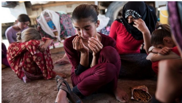
Yazidi escapee from ISIS captivity.

IS’s treatment of captured women reveals a different side of its biopolitics. Whereas in the case of Muslim women IS demonstrates a strong if by comparison seemingly trivial obsession with controlling individual and collective behaviors of the faithful, in the case of captive women it positions itself as a sovereign power with authority over life and death, determining the very form of life (or lack of it thereof) that captured women experience. In August 2014, IS raided the Sinjar area in northern Iraq, home to the followers of the ancient Mesopotamian Yazidi faith. What ensued has been described by the United Nations as an “ongoing genocide,” 5 as IS is estimated to have massacred hundreds of Yazidis, mostly men, and captured thousands of Yazidi women and girls who have been subjected to sexual slavery.