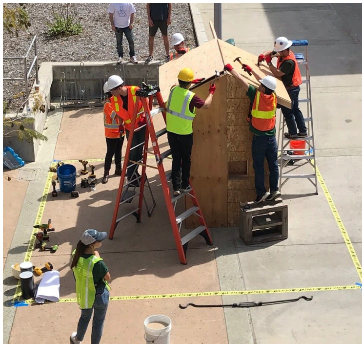
Figure 2: Aerial View of the team working on the structure at the Timber-Strong Competition

The time crunch played a large role in our building for the competition, but with the extra time we had during Spring Quarter, we were able to work carefully and diligently in bringing a much more pleasing finished product. After carefully going over plan drawings, details, materials, and specifications of the project, we began building the dog house.