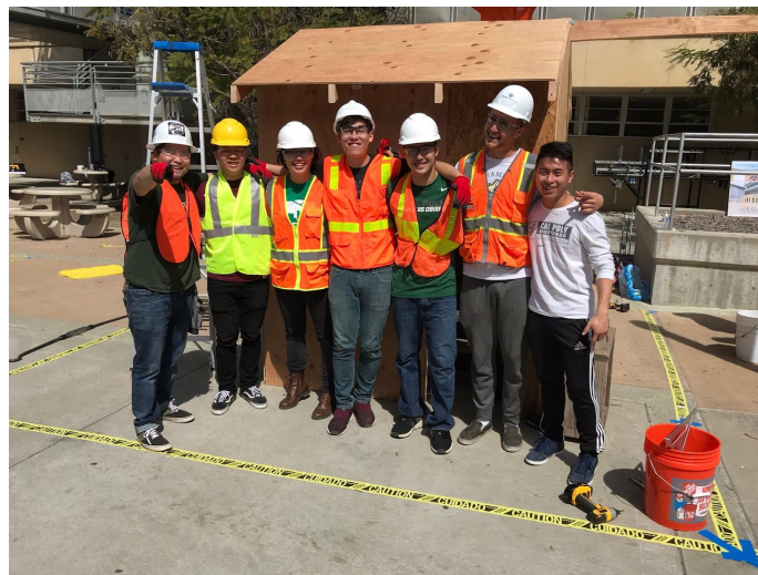
Figure 1: Entire group (except Max) at the Timber-Strong Competition, post-construction

Overall, the Timber Strong competition was an eye opening experience in the construction process, however there are a few changes to the competition that would greatly benefit the immersive experience. A recurring problem found in the project prompt was ambiguity in what was expected in many portions of the calculations and construction process. For example, designing to code for a 4'x6' structure was unrealistic, as using a 20 psf live load for the roof resulted in a heavily over-designed roof system. In addition, the project prompt never specified whether or not to use ASCE 7-16 load combinations for lateral loading, it only stated to design for a 350 plf lateral load. Also, it was permitted to have the walls minus the sheathing fully prefabricated, but it never stated specifically what can be considered wall components. This left ambiguity in the requirements for prefabrication of double top plates and top plate/rafter connection hardware. These are just a few of the equivocal requirements found in the Timber Strong competition guidelines that could have used more detailing.