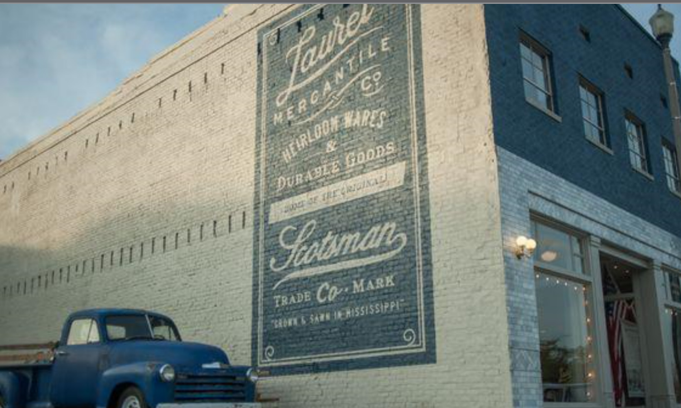
Figure 11: Preserving iconic advertisements of the past- or creating newer versions are fantastic elements which evoke the past.