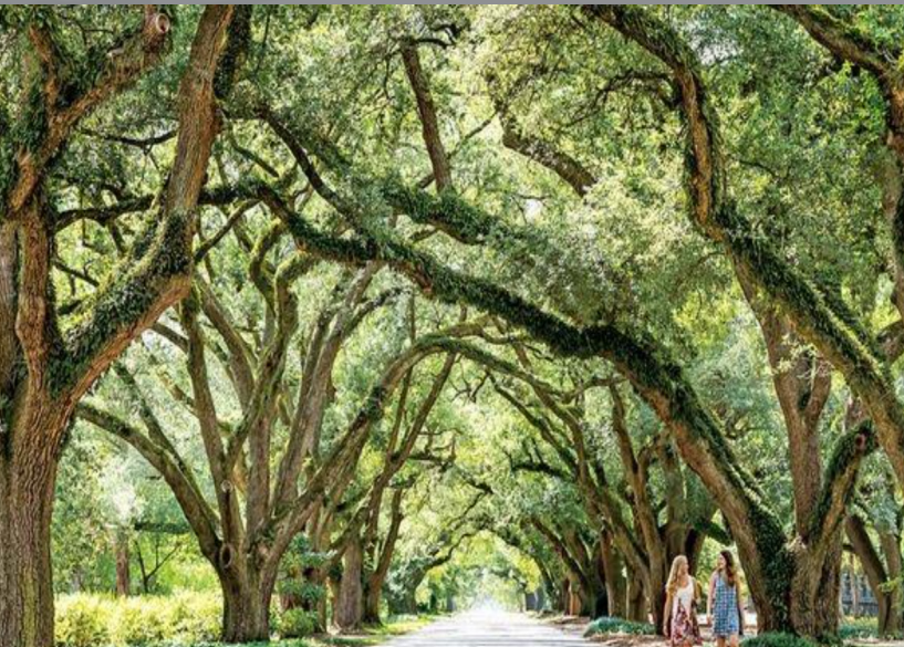
Figure 6: Whether you are sitting in a coffee shop, strolling through downtown or reaching the peak of a mountain after a long hike; scenes such as this, provide a certain draw factor - an 'it factor.' An indescribable explanation that draws people in.