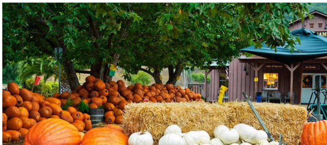
Figure 25: (Avila Valley Barn, Avila Beach). Potentially every small town community's greatest resource. Agriculture's collectives and CSA's not only support the local farmers and growers but also create an unforgettable experience for families and millennials who wish to experience organic and natural products every change of season.