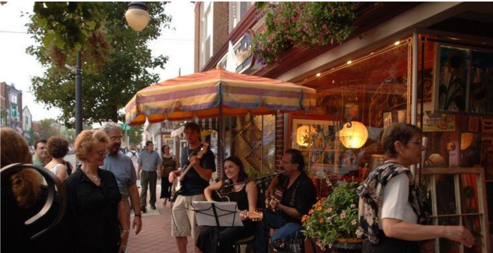
Figure 4: Local Musicians play live music outside a commercial store in downtown, attracting a crowd.