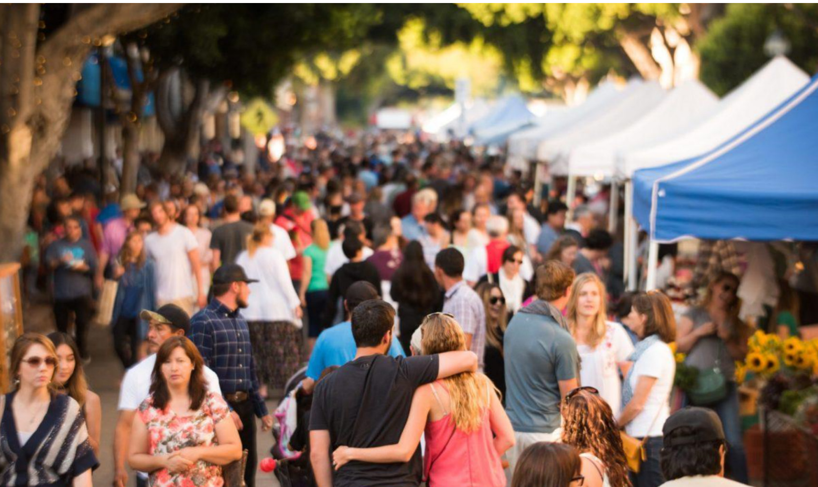
Figure 28: The famous farmer's market in downtown San Luis Obispo is a fun activity for families and college students. It is also a perfect opportunity for farmers, growers, and artisans to exchange and celebrate local product.