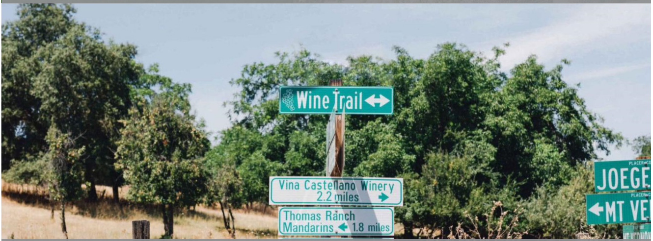
Figure 21: (Placer County) Brew and Wine tourism is a successful strategy the county has used to create experiences for younger generations. There are a variety of wineries and breweries that have become an iconic piece in our identity.