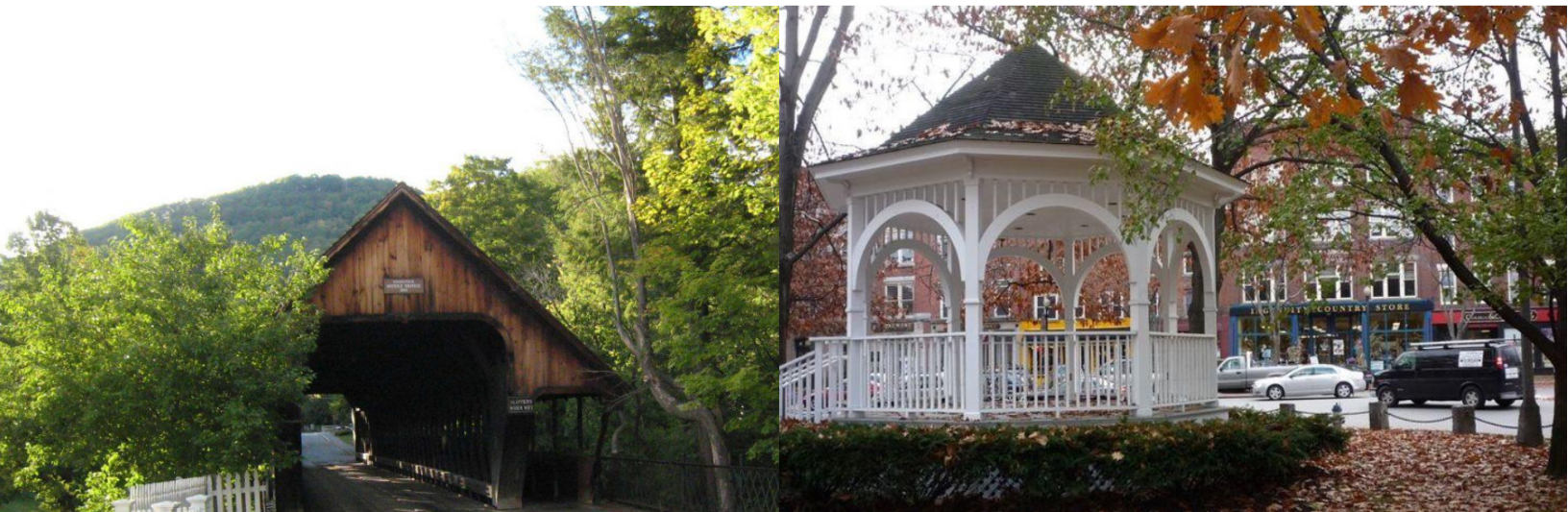
Figure 10: Preserving iconic 'identity markers' like gazebos, covered bridges, church steeples and more have lasting impact on a community's character

Small towns with a heritage in art and those rebranding themselves in the arts attract millennials who wish to experience living history themselves 1 . Incorporating