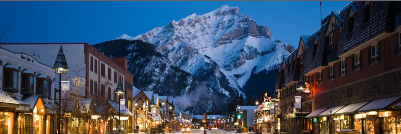
Figure 5: (Banff, Alberta) A small village tucked away in Banff National Park Canada. Banff is a popular destination for young people from around the world who are attracted by its small rustic village charm, world-class outdoor recreation and its restaurant and brewery scene.