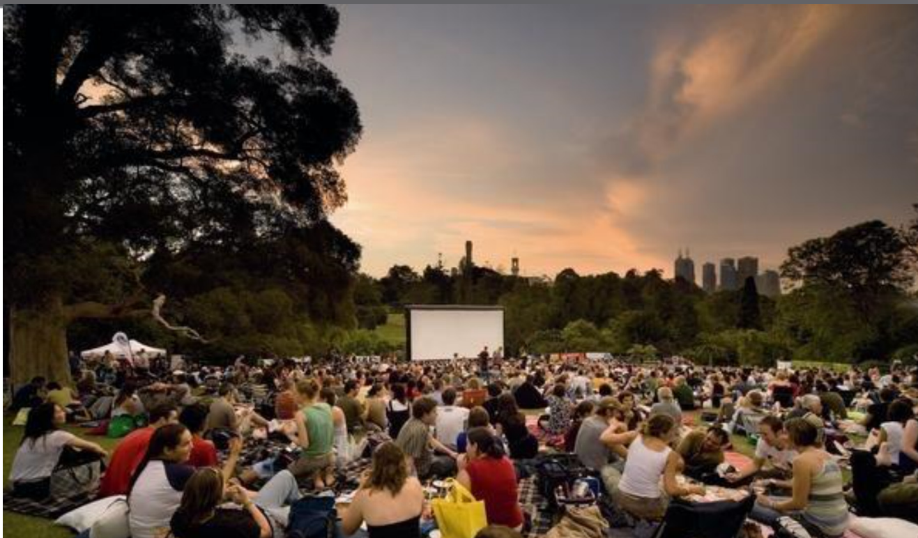
Figure 26: Community events, such as a public movie showing, can make community fun, engaging and interactive. Small towns can utilize vast open spaces in and around their community such as parks, outdoor open areas, and football fields for such activities.