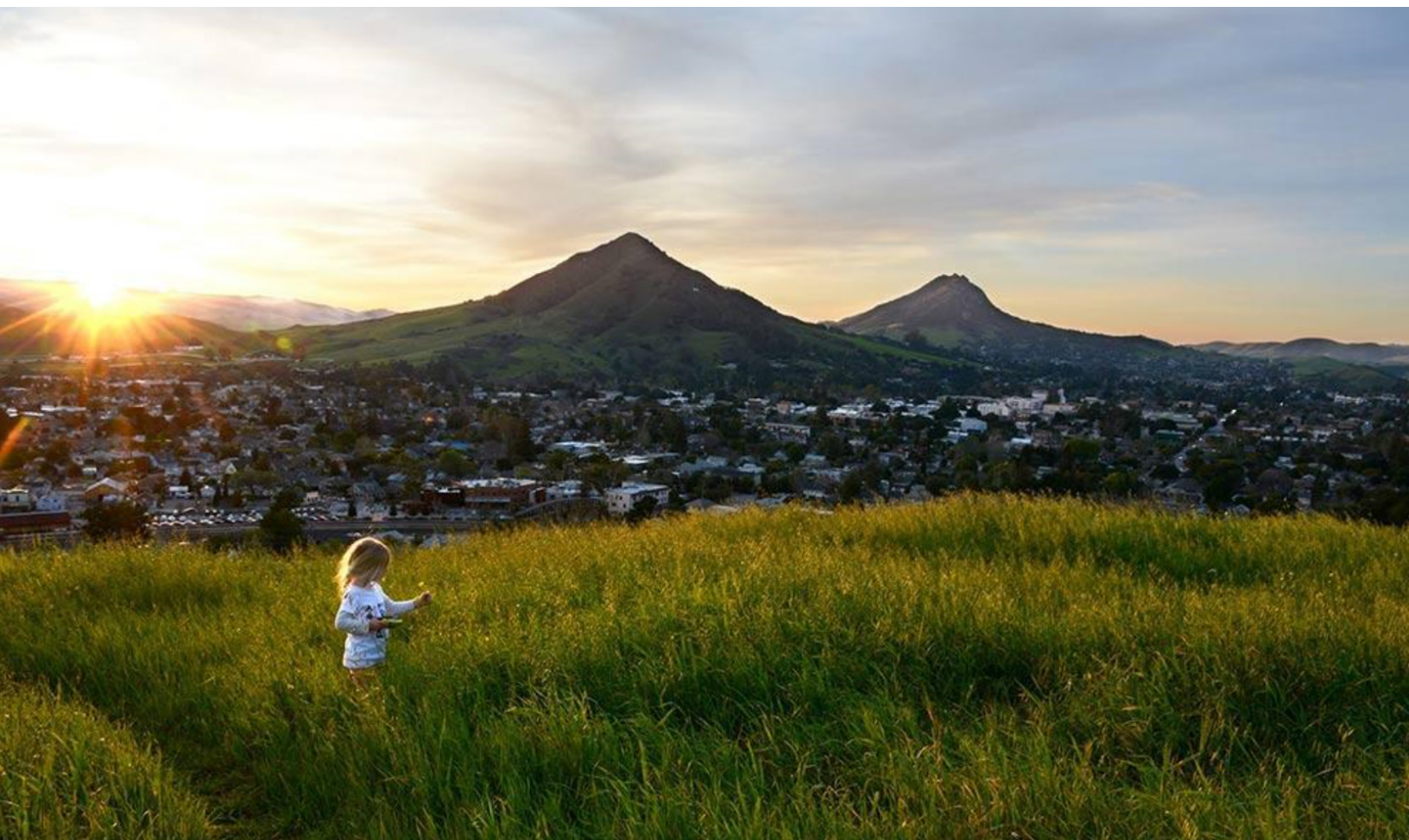
Figure 30: The city of San Luis Obispo has given public access to mountains and hills in the city, zoned Open Space. The result is multiple opportunities for community members and families to become active and experience a unique perspective of their city.