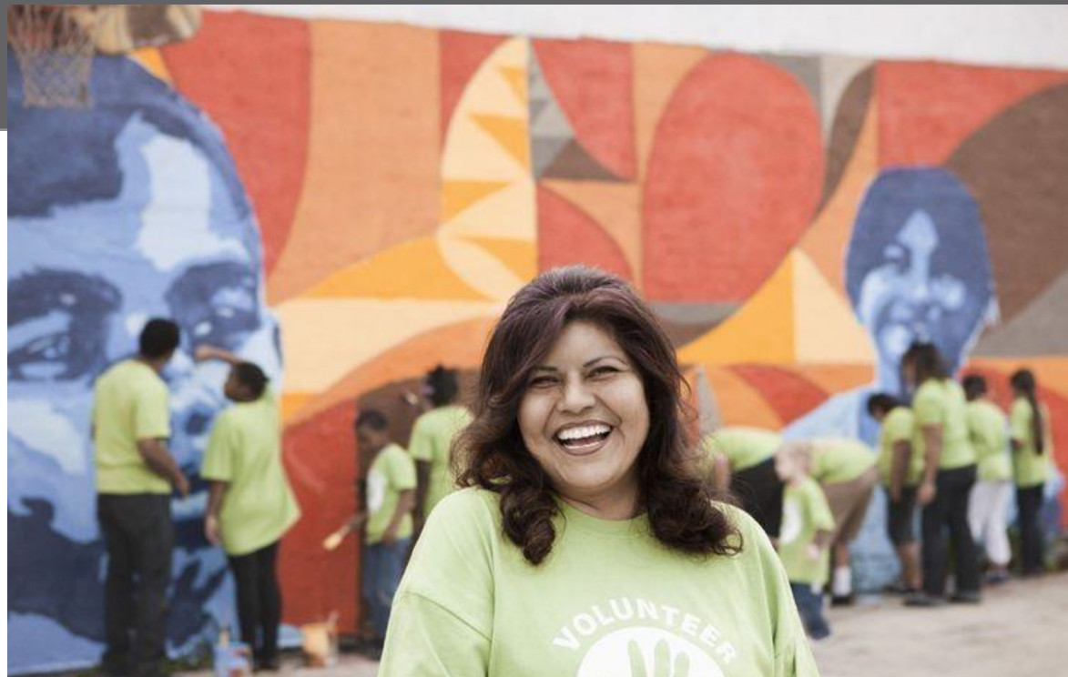
Figure 19: Millennials have historically been overlooked when it comes to community engagement. Ironically, they could provide the most useful answers to attracting and retaining members of their generation.