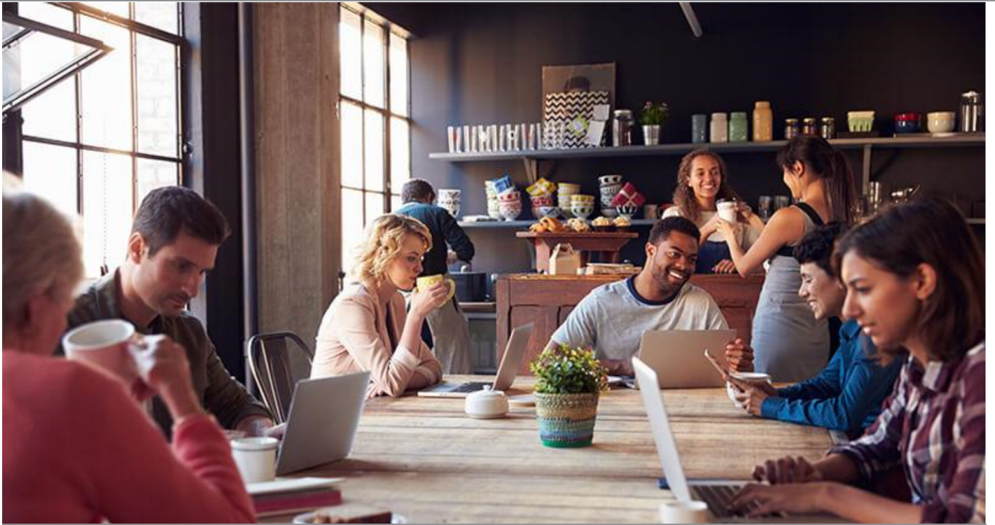
Figure 23 : Coffee shops are the stereotypical example, but having reliable access to the internet in public places can encourage younger generations to utilize their technology in social gatherings places.