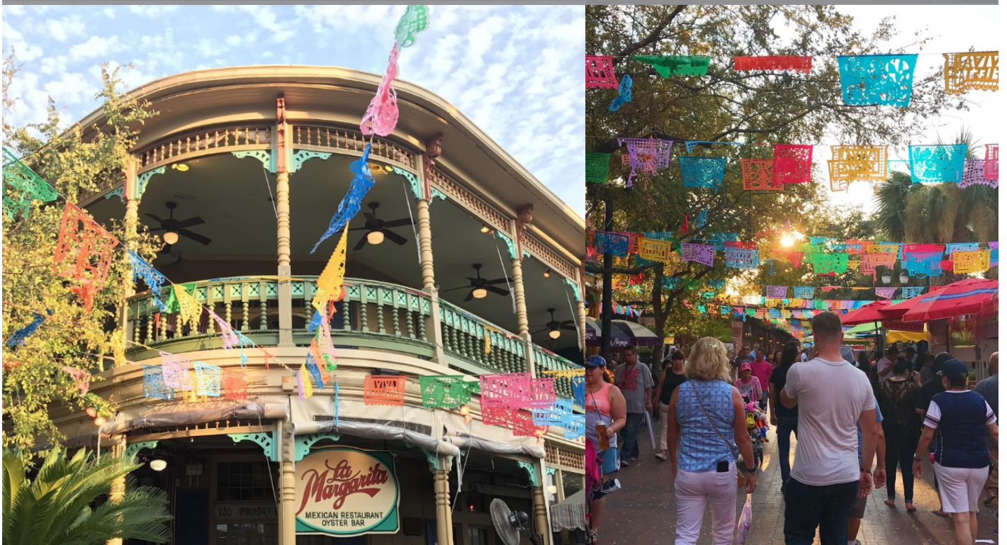
Figure 24: Using color and cultural aesthetics (such as papel picado hanging above) in San Antonio's Market Square has given the city a sense of stepping into a little "Mexico City" and expanding different nodes of its downtown. Even while San Antonio is a much larger urban center, imagine the sense of exploration in a miniature French Quarter, Little Italy, or Chinatown should it be developed in a small town.