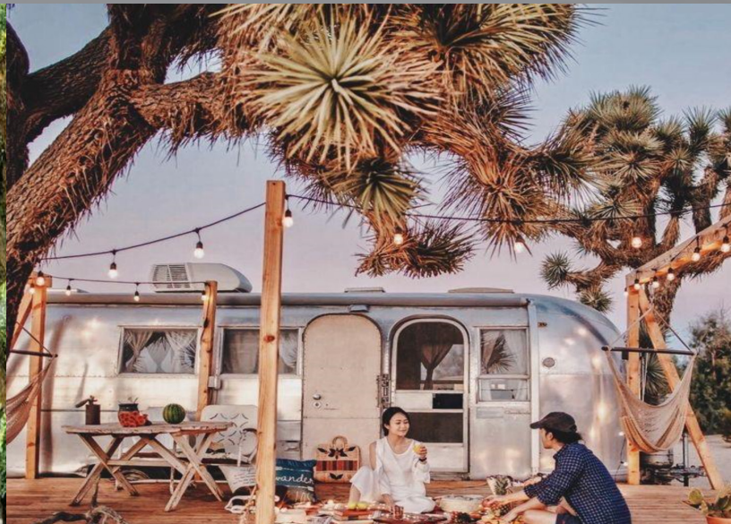
Figure 7: Even hard to reach places like Joshua Tree, CA have been a popular attraction for millennials. While Joshua Tree may not be a sprawling city, those who like to experience new things like 'Glamping' or its great outdoors are drawn to it.

Something that makes community engaging. That connects everyday ordinary people with art and cultures and a sense of togetherness.