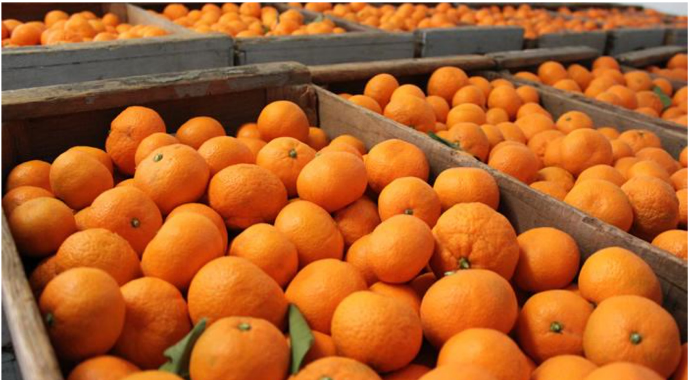
Figure 2: My hometown is famous for its Mandarin Oranges. This has made Agri-production and Agri-Tourism a majority part of its community identity.

ordinance; it also teaches you how to be active, but embedded in the small town, big family atmosphere that these communities possess.