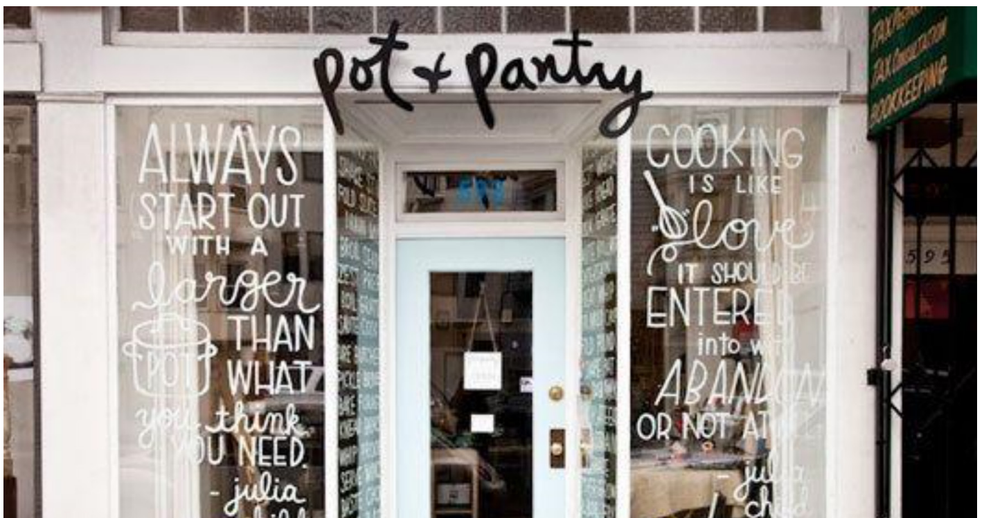
Figure 14: Window painting is a creative and aesthetically pleasing way to advertise their company. Cities can allow businesses to be creative while maintaining a central theme. It does not necessarily need to be strictly advertising related- clever captions make businesses relatable!