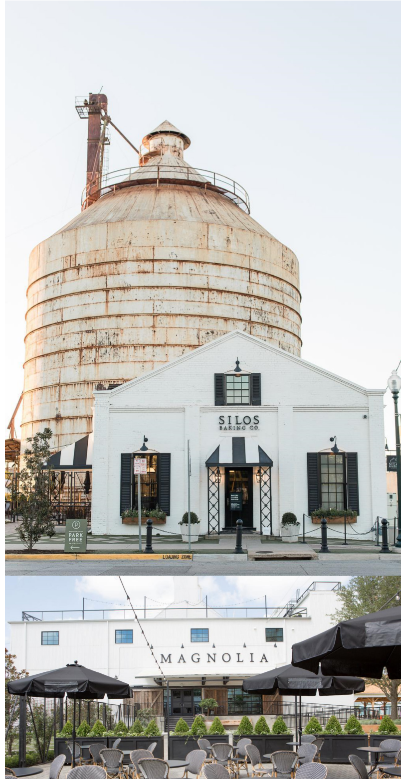
Figure 26: Magnolia Market in Waco, Texas is a successful and aesthetic pleasing retrofit of old industrial silos into a lively marketplace. Many small towns and rural communities have underutilized industrial or manufacturing space that could be retrofitted into a unique social hub.