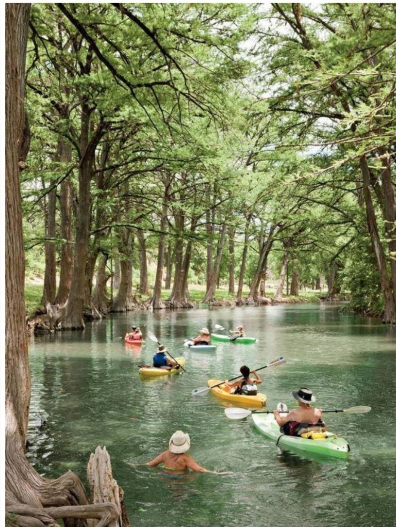
Figure 27: Even small town communities should have an active engagement in maintaining trails and streams for recreational use by families and community members.