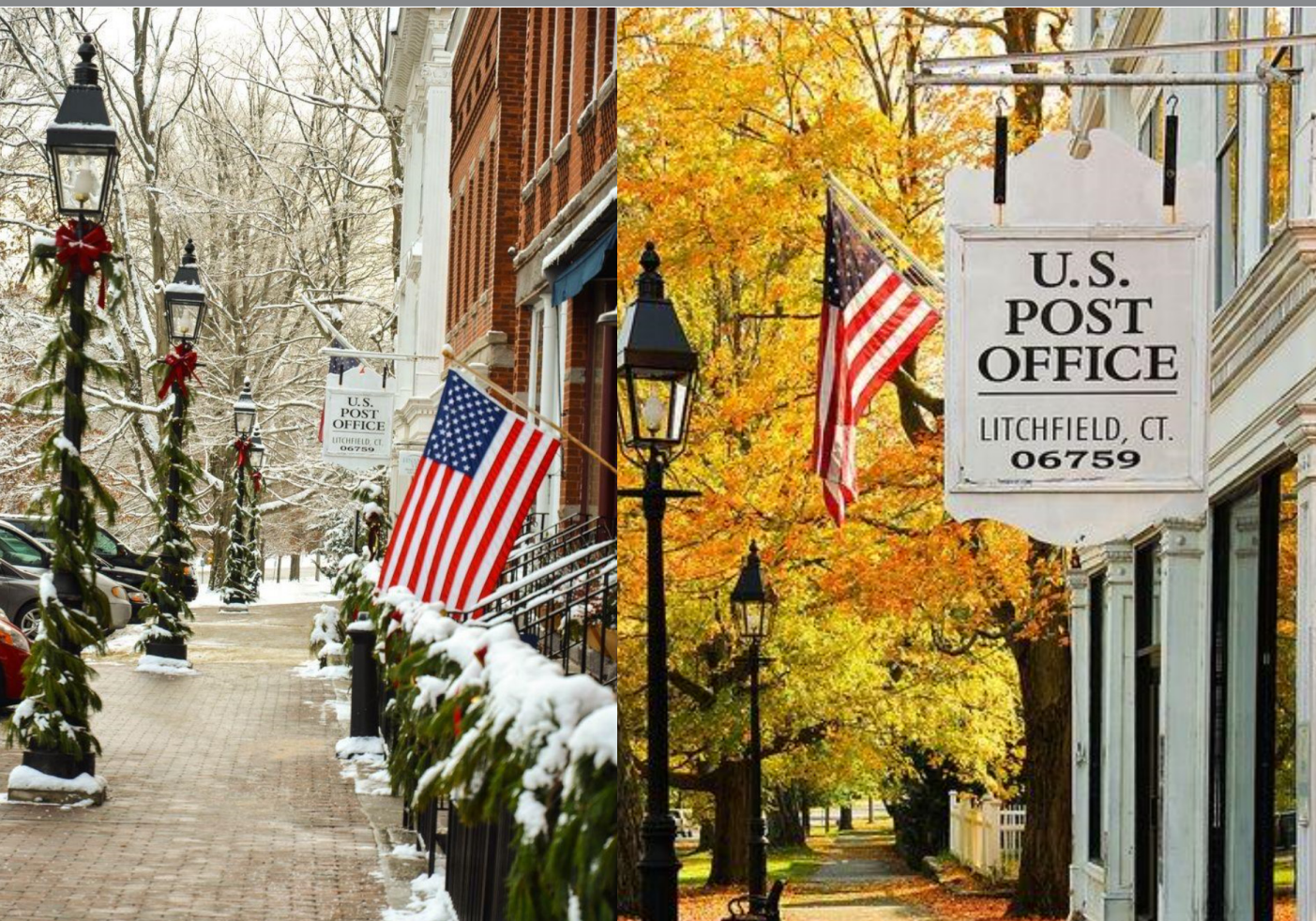
Figure 12: Litchfield, Connecticut. incorporating the changing seasons (spring, summer, and fall, winter) into the community's character creates a unique sense of predictable change while retaining its core elements of place.