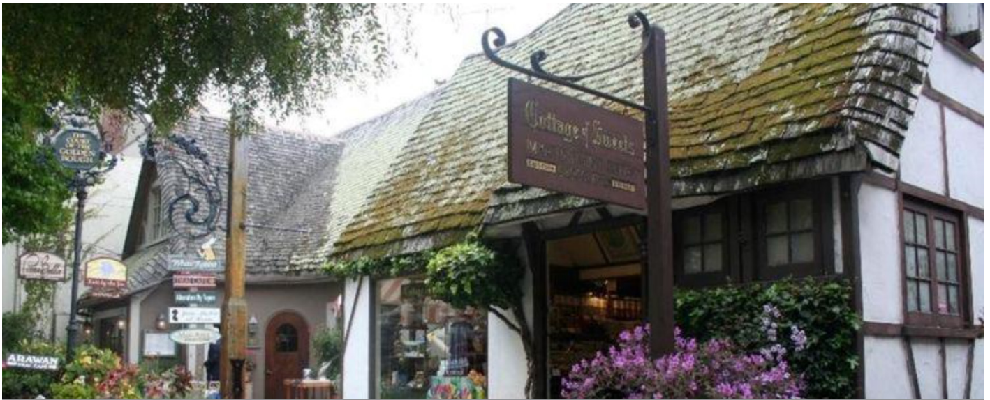
Figure 8: Carmel by the Sea, CA which possess the charm that millennials love and want to experience. Cultivating its own unique identity.