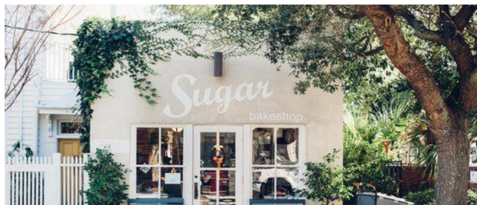
Figure 13: While many municipalities suggest repainting downtown commercial areas as a way to "revamp" their downtowns, they typically only repaint a newer layer of its existing color. Millennials these days are infatuated with high contrast colors (White, Black, and Orange) and natural (Creams, pastels). While the above pictures represent a much larger, denser communities, smaller communities