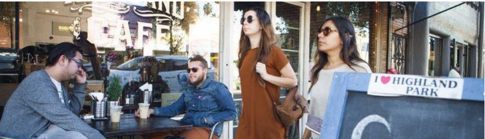
Figure 17: Outdoor seating, artistic elements (A frame signage, human scale light fixtures and amenities) can create a lively and intimate space for pedestrians.

The biggest advantage physical retailers have over online retailers is giving customers the opportunity for interaction: tactile, visual, auditory, and social. Many locations now present live music, unique vendors, venues and mobile apps that integrate digital technology into the environment. Public Spaces that encroach into the public realms energize surrounding streets and create foot traffic that can boost business and invigorate street life in a neighborhood. Compact intersections make it easier for pedestrians to cross while maintaining edge with heavy planters, granite blocks and other street furniture elements can provide security against vehicle traffic. Minimizing intersection size through curb extensions and medians and adding moveable seating and allowing commercial vendors creates one seamless pedestrian realm. Small town communities can and should utilize space that encroach into the public realm.