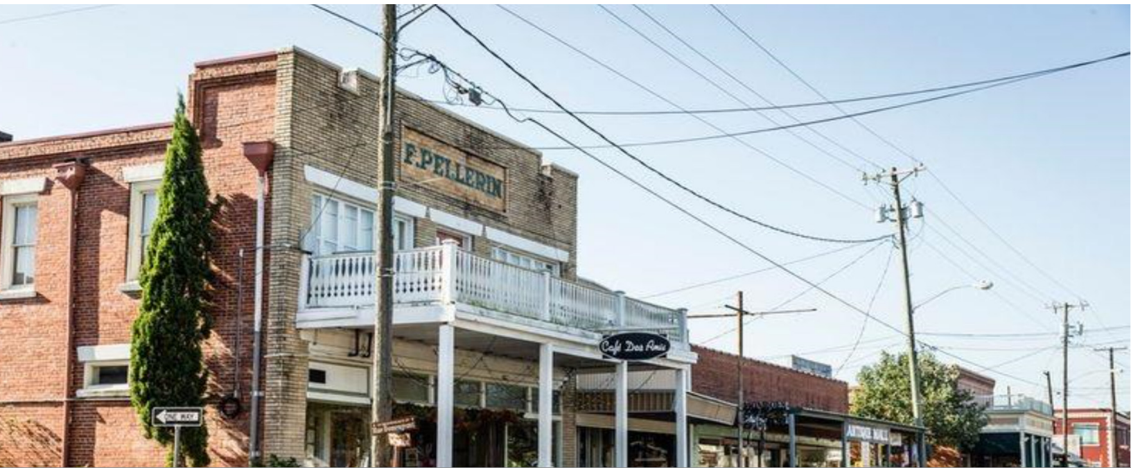
Figure 3: Breaux Bridge, Louisiana. For decades small towns like this have had an increasing net emigration of millennials, leaving shells of vibrant, socially cohesive communities that once were.