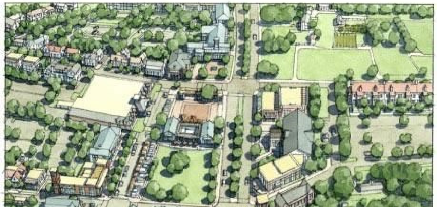
Figure 16: In addition to prioritizing alternative transportation, utilizing space, creating infill development and concentrating sprawl can make communities accessible, walkable and convenient to commute around. Particularly small town communities should concentrate their infill in and around their main street core.