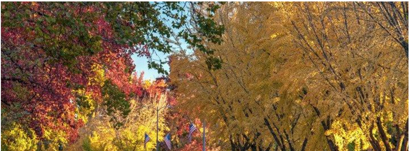
Figure 15: Chico incorporates trees and foliage within the public and design realm. By incorporating trees into the public space, they bring a natural element into an urban environment and break up repetitive space. By forming a tree canopy over the street, Chico is able to cultivate an iconic identity and create a unique and dynamic experience when spring or fall comes around.