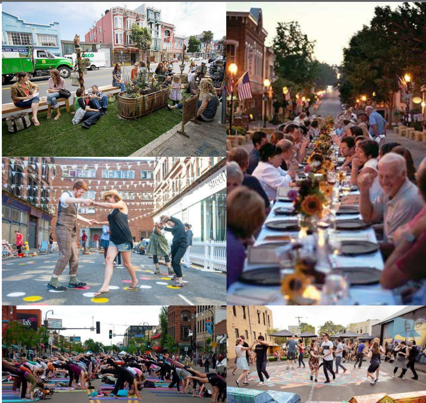
Figure 22: The term “Tactical Urbanism” also includes closing down popular streets, converting underutilized parking areas and excess spaces into social events that bring community members together. Whether temporary, annual or permanent, nothing brings communities together like utilizing a space for different purposes.