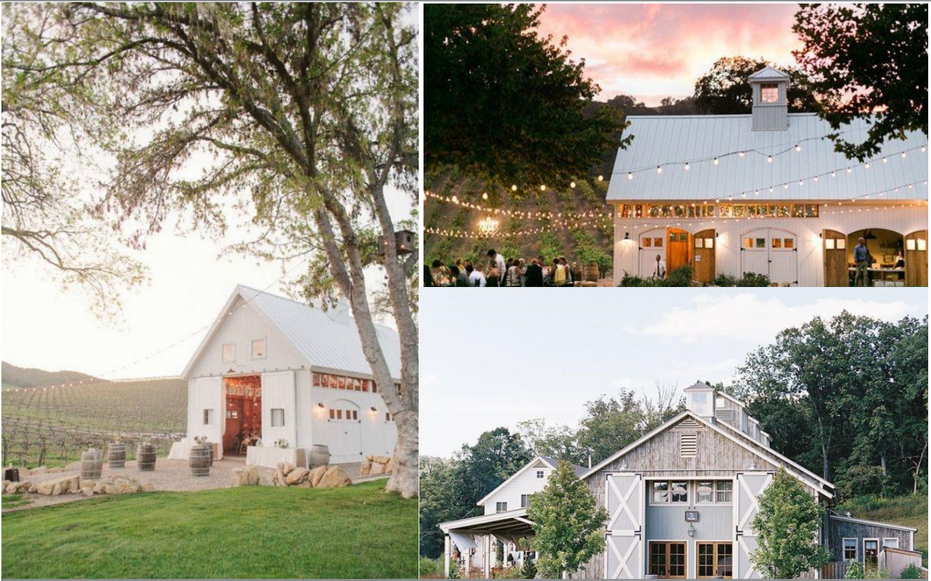
Figure 20: (Paso Robles) Venues for wine tasting, holding weddings and live music capture the charm that rural communities provide.