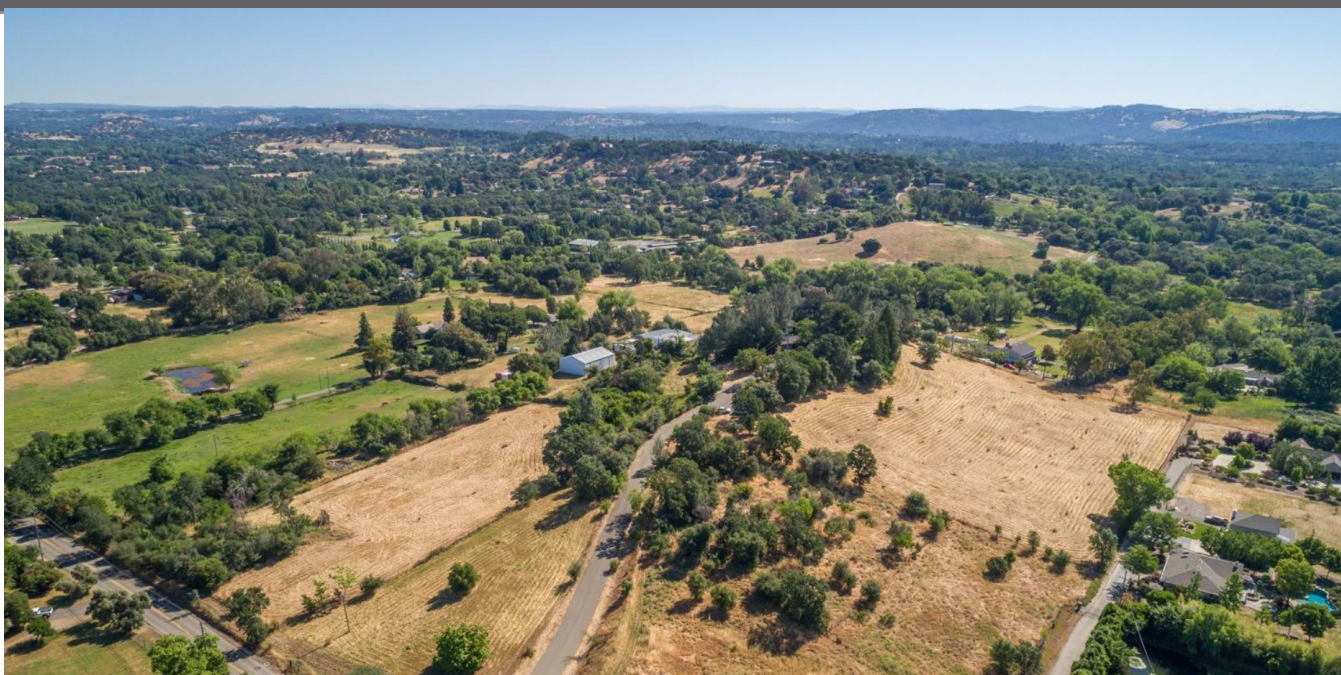
Figure 1: The outskirts of Loomis, California- my hometown. Pop: 6250. Though it may not look like it, there is much to do in the town that has attracted many younger families. These attractions include wine and beer tasting, excellent local restaurants, great outdoor opportunities and a historic downtown

As a planner, I have made mistakes in small towns. I have also watched the dreams and aspirations of other planners, learned since their first day of university, crumble in dust and observed them pack their things and leave the profession in frustration. By understanding the fundamentals of a small town community and its relationship to their planner, I have learned how to prevent the developers, community members and aspiring planners from committing the most egregious mistakes, from stopping investment of city resources in projects and protecting them from becoming reality. Such caution, such hesitance to move forward, such check-and-balance, is what protects a small town's character and quality of life. There is a classic contradiction within these places; they want to improve themselves but grapple with their reluctance to change. I have come to realize, such qualities of resistance are healthier than I originally thought.