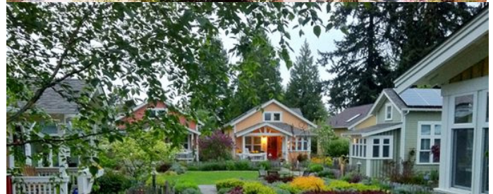
Figure 9: Tiny Homes are a popular housing alternative for younger

generations who are open to finding affordable housing options