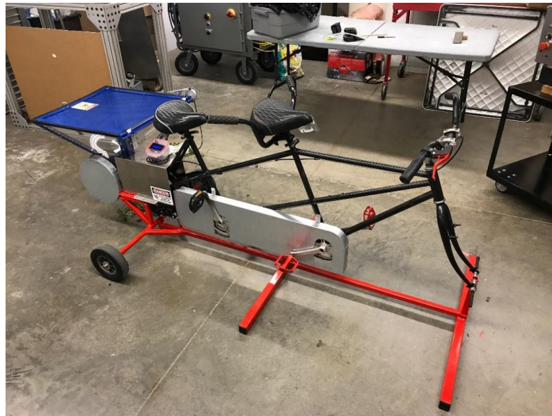
Figure 5. Fully assembled Compost Chomper.