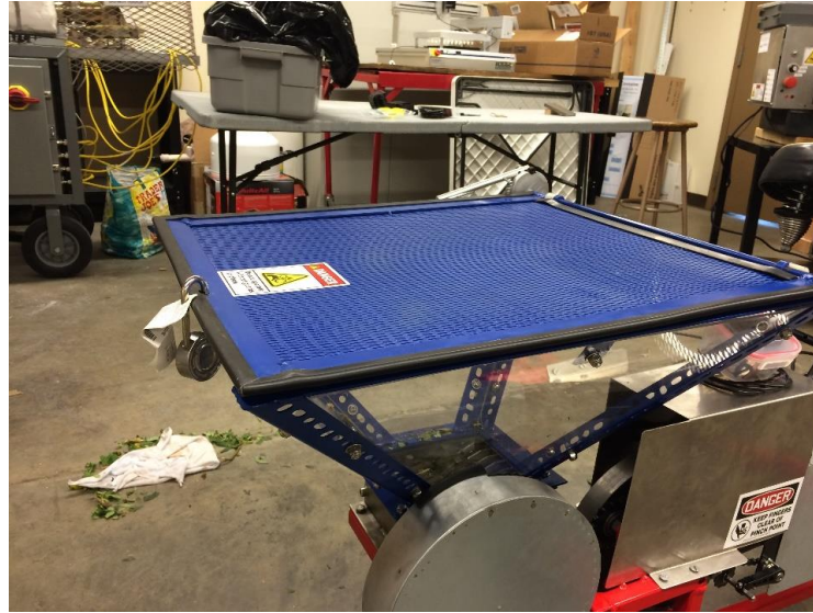
Figure 4. Hopper and sheet metal safety mechanisms.

In the interest of keeping the children safe while they operate this potentially dangerous device, a hopper and other safety mechanisms were employed. The hopper is designed efficiently feed the material to the cutting device while also separating the children from the cutting blades while the device is in use. This is done by using a hopper lid which prevents the children from putting their hands near the blades. A braking mechanism was designed to stop the cutter from spinning when the lid is opened. Sheet metal guards were also fabricated, courtesy of Paladin sheet metal, to eliminate potential pinch points within the drive train.