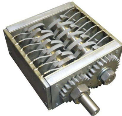
Figure 2. Filamaker shredder.

The team decided to purchase the Organic Waste Shredder from Filamaker (Figure 2) to use as our cutting mechanism. Buying the cutting mechanism drastically reduced the complexity of manufacturing the final product and guaranteed a certain quality of cutter that otherwise the team may not have been able to achieve through manufacturing.