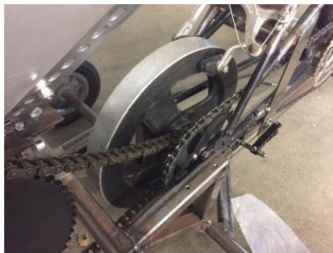
Figure 3. Assembled drivetrain.

To power the shredder, a drive train had to be designed. The goal was to allow for maximum cutting torque while keeping the device easy for the children to pedal. Using the tandem bicycle as a template, the drivetrain was assembled. A flywheel and gear reduction system (see Figure 3) were utilized to make pedaling smooth and easy for the children.