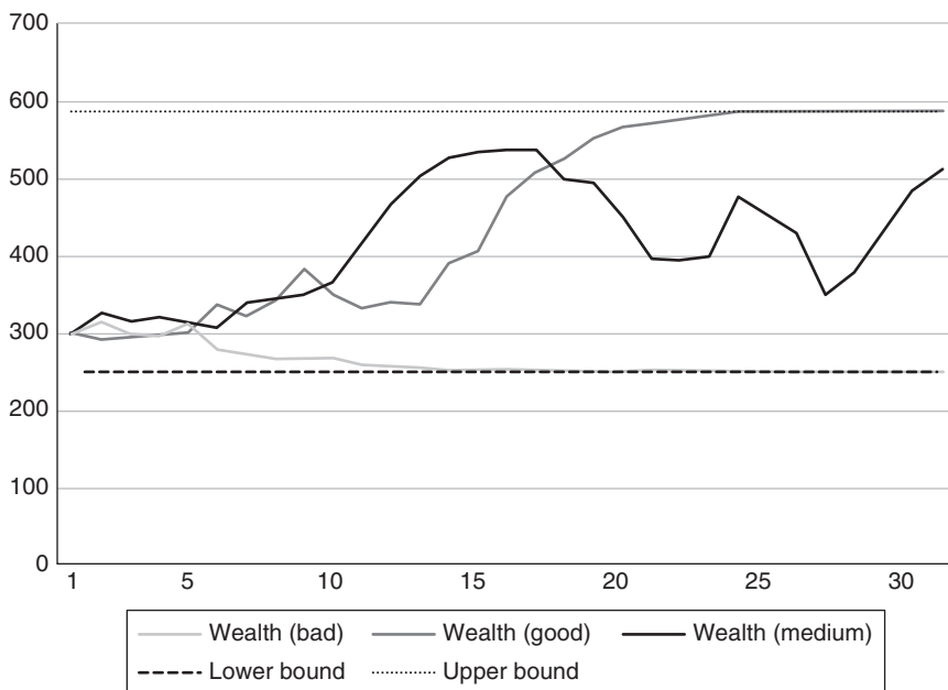
Figure 9.2 Sample paths of accumulated wealth for a one-off contribution during the 30 years for which it is invested, with bounds

Note: Here the strategy incorporates both a lower bound (dashed horizontal line) and an upper bound (dotted horizontal line) on the wealth at retirement. The light grey path shows a pension saver who accumulates the minimum amount at retirement, which was set equal to the chosen lower bound. The dark grey path shows a pension saver who accumulates the maximum level, as fixed by the upper bound. The black path shows a pension saver who accumulates wealth in between the fixed bounds.