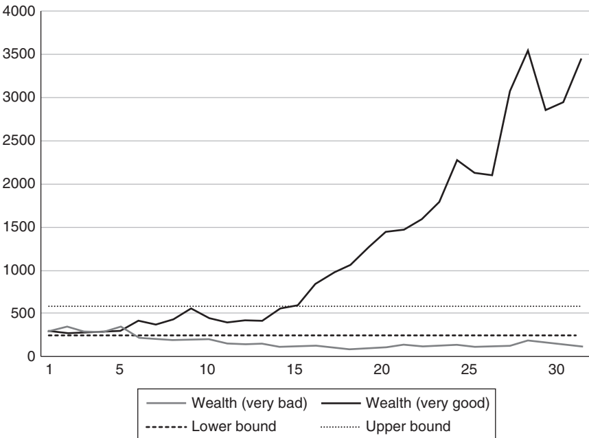
Figure 9.1 Sample paths of accumulated wealth for a one-off contribution during the 30 years for which it is invested

Figures 9.1 and 9.2 compare those two scenarios. Figure 9.1 presents the unrestricted case, showing two pension savers over 30 years with no restrictions on their retirement wealth. One saver is very unlucky to have much less than the initial investment, as shown by the grey line, and another is fortunate and ends up with a very successful investment, as shown by the