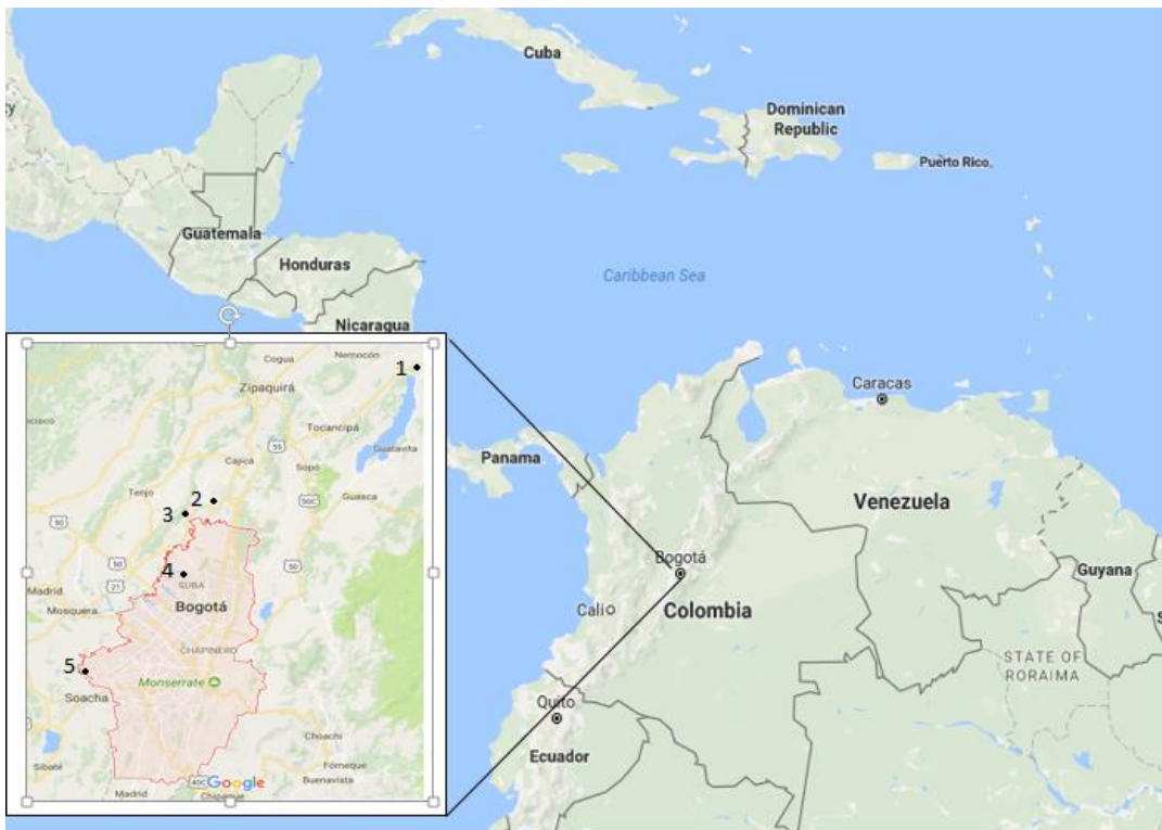
Figure 1: The five recognized Muisca groups. 1. Sesquile, 2. Chia, 3. Cota, 4. Suba, 5. Bosa.

multiculturalism, however, some of those deemed to be mestizos have self-recognized as Muisca and have formed more than ten Muisca groups, five of which have been officially recognized (Figure 1). The groups formed as a way to respond to the challenges of adapting to the modern/urban condition, which involves isolation, abandonment, privatization, and financial instability (Rew and Campbell 1999), producing “communities of sentiment” (Appadurai 1990) that gained cohesion thanks to their members’ shared experiences of struggle and the affects unfolded by them.