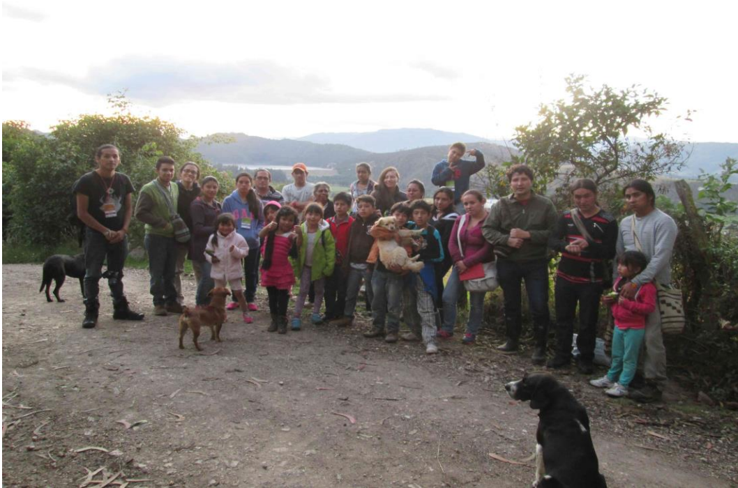
Figure 7: Members of the group from Sesquile posing for the camera after the workshop.