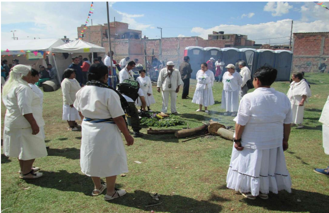
Figure 2: Performance by members of the Muisca Community of Bosa in a local park.

to face criticism, to the point that they preferred to stop advocating for the common interests of the community and instead focused exclusively on claims based on their indigeneity. Moreover, despite the determination of the recognizing institution that the Muisca of Bosa could be officially recognized on the basis of their surnames and their permanence in the area of San Bernardino since the colonial period, their mestizo neighbours usually denied their indigeneity. To them, the Muisca have failed to show enough cultural alterity vis-à-vis themselves, as they have shared the mestizo lifestyle for generations. In most cases, the mestizos expect to see in the contemporary Muisca a form of alterity that resembles their own idealizations of the indigenous other, usually based on the colonial depictions of the Muisca that were shown to them at school.