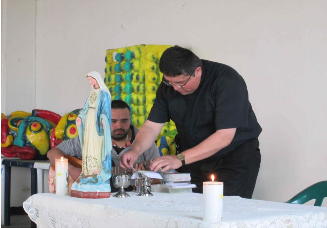
Figure 12: The Virgin Mary from the governor' office. In this case, a mass is celebrated in the office.