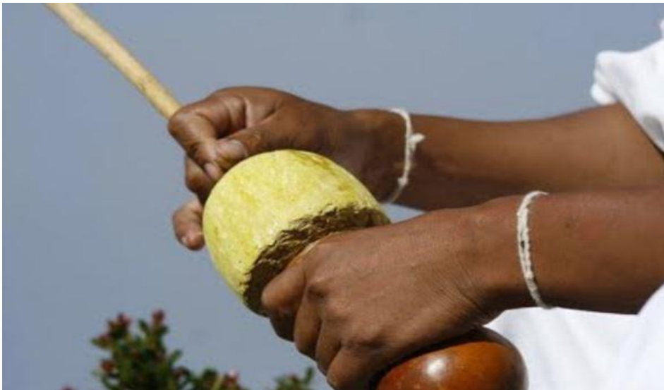
Figure 11: The poporo.

cultural repertoire in the early 2000s with the consent of the Kogui. To use the poporo, men place the wooden stick it in their mouth to moisten it and then introduce it inside of the poporo to retrieve the seashell powder, which attaches to it. Then, the powder is placed in the mouth to mix with the coca leaves that they are already chewing. Meanwhile, they rub the neck of the poporo with the end of the wooden stick, so that the remnants of the crushed shells attach to it, producing an even coating of shell that becomes thicker with use, reaching radiuses of several centimeters after years of use. Kogui leaders, known as mamos, are always seen rubbing the necks of their poporos when in public, while non-leaders are somewhat less consistent in their use of the object. In any case, every Kogui male receives a poporo during the rite of passage into adulthood, and is expected to carry it in their woven knapsack for the rest of his life (Reichel-Dolmatoff 1950).