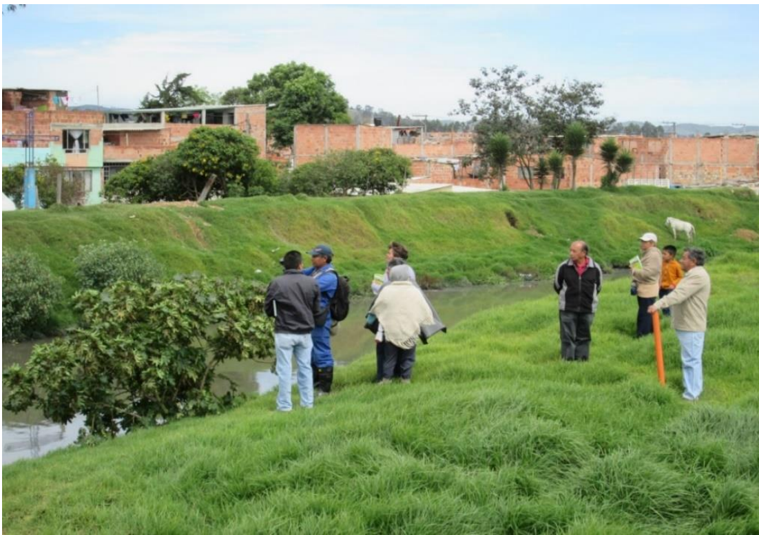
Figure 3: Tunjuelito River in Bosa San Bernardino.

I kept walking down the road until I reached the San Bernardino school and, on the opposite side, the house that functions as the administrative office for the Muisca group of Bosa. When I was close enough to this indigenous house, I could appreciate that its façade had a mural depicting the profile view of an indigenous man, geometric figures, and corn plants. Apart from the mural, however, the house was no different from other buildings in the area (figure 4).