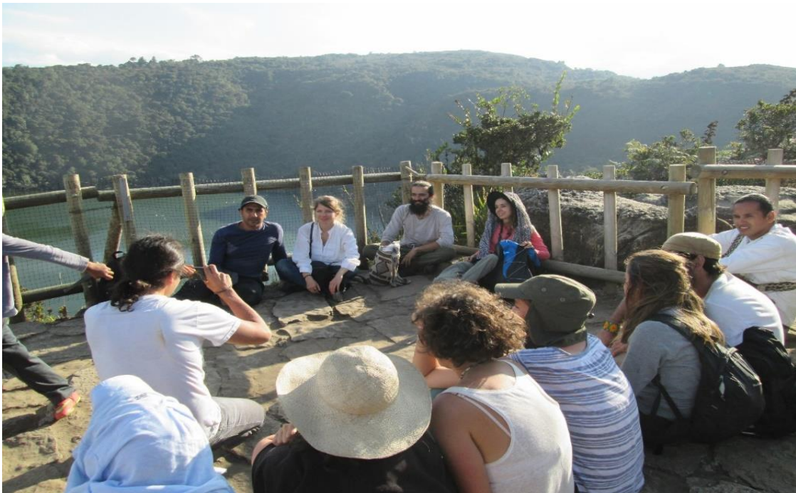
Figure 5: Tourists visiting the Guatavita Lake.

early colonial periods. Hundreds of local and international tourists visit the lake every weekend (figure 5), as well as the recently built town of Guatavita, where the majority of entertainment and eating options are located. Conversely, Sesquile is a small and quiet town. Most locals work in the surrounding farms or in the flower plantations; men who are not working on the farms are usually independent builders, working in Bogota for small projects of house refurbishment. As in Bosa San Bernardino, most dwellers of Sesquile live in poverty, but their living conditions are much less hazardous than those of their Bosa counterparts.