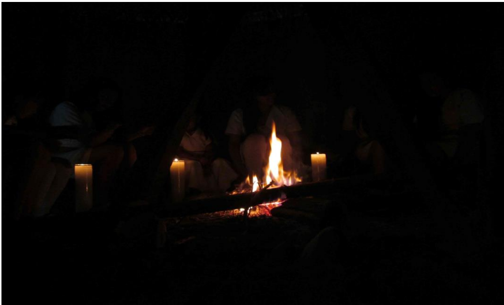
Figure 10. Inside the cusmuy in Bosa.

cusmuy are part of members' maps of intensity, they provide a cultural-affective context that is usually connected to emotions such as happiness, pride, and calm. On the other hand, the cusmuy in Bosa was not a part of the group since its formation, and members are not required to join cusmuy gatherings to remain members. Thus, sensorial stimuli in the cusmuy in Bosa (figure 10) are experienced as unexpected changes in the ambient background during members' first visits. These changes frequently generate affective responses of a loss of power (Deleuze 1978) that unfold into emotions of discomfort, fear, anger, and distrust, because the responses get connected with previous affects of similar intensity that are part of member's maps of intensity, even if they are not related to Muisca spirituality. Instead, those previous affects are usually connected to the Muisca's current living conditions or to a sense of nostalgia for a better past.