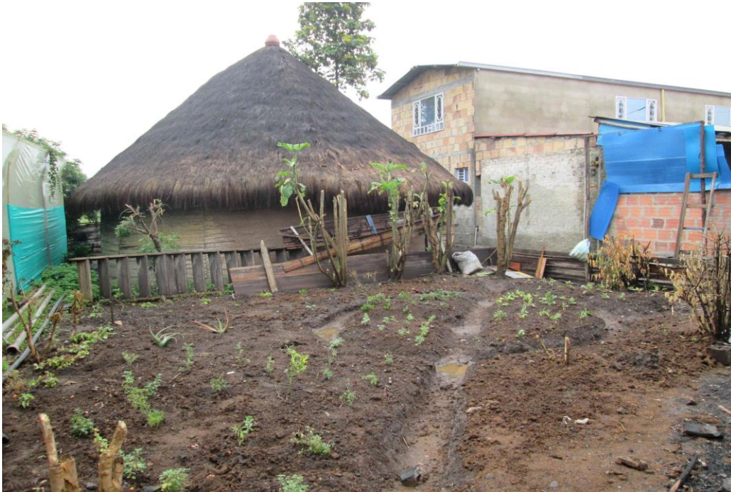
Figure 9: The cusmuy of the Muisca Group in Bosa.

However, while the cusmuy in Sesquile is visited on a weekly basis by at least one family member from each household, only a few members of the group in Bosa visit their cusmuy on a regular basis. In Bosa, most members perceive the ceremonial house as a late incorporation that fails to represent their indigeneity, as it is unrelated to their family histories as indigenous and mestizo. Unfortunately, the consumers of the Muisca brand—including state institutions, private organizations, the mestizo majorities, and even other indigenous people—have interpreted the Bosa Muisca's limited interest in the cusmuy as evidence of inauthenticity and even dishonesty.