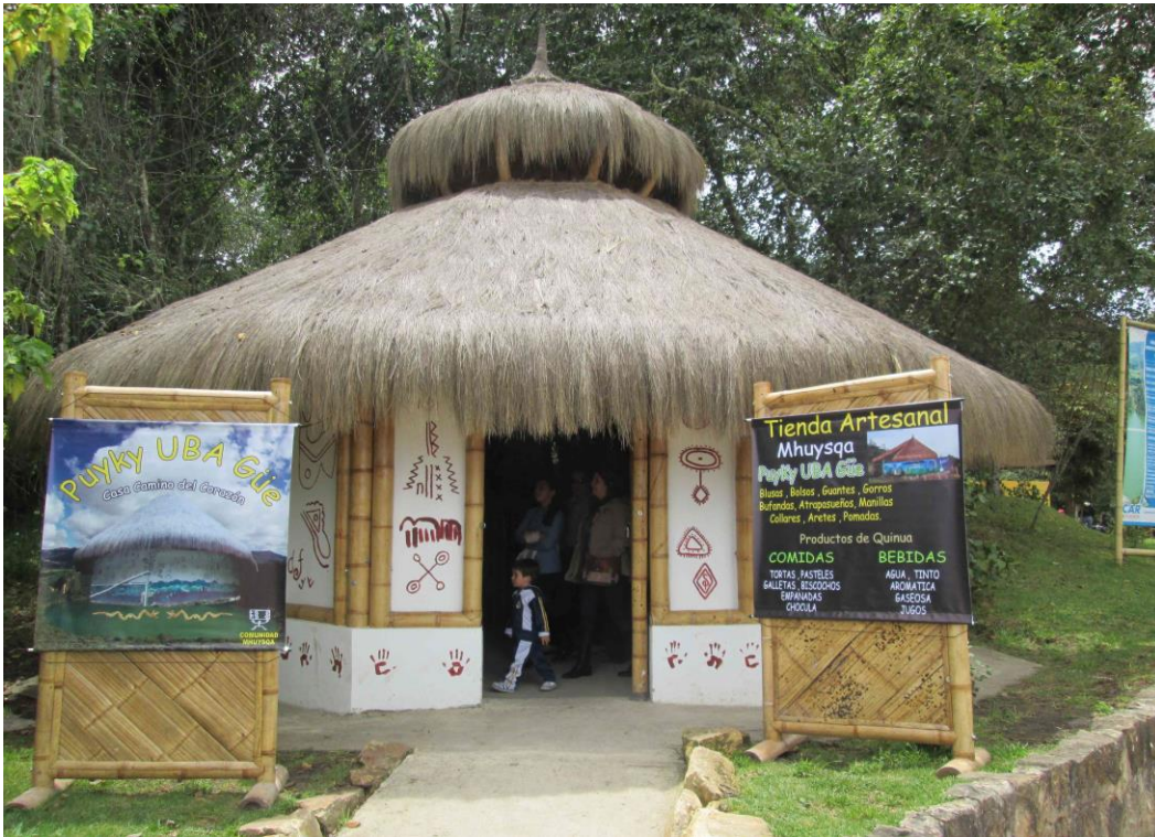
Figure 13: The Muisca shop at the entrance of the Guatavita Lake.

During fieldwork, I worked in the shop for a few days and realized the expressions of disappointment of visitors as they entered and failed to find what they were expecting. However, a Muisca poporero was always there, ready to explain why those products are true representations of the Muisca and their spirituality, even if the intentions of the actual producers, mostly women and children, differ from the poporeros' pre-arranged narrative. Within this narrative, the mochilas are a representation of the universe, the honey and quinoa are produced in accordance with the spirits of nature, and the spiritual thoughts of the Muisca weavers are said to be infused into the bracelets they make. In this case, despite the equivocation between the intentions of the visitors to find tokens of an imagined Muisca spirituality and the