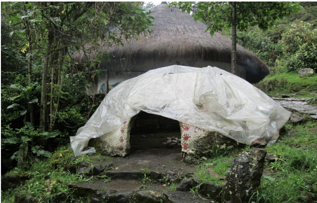
Figure 6: The cusmuy of the Muisca group from Sesquile.

of Sesquile. The man told me that I had to walk to the edge of the urban area and then follow an unpaved road until finding a bifurcation leading to a stone-made stairway. The stairs led me to a white hut made of bahareque , a mixture of dried mud and grain stalks. The hut had a wooden door, locked with a chain and a lock. Not far from this hut I found another one, then another one and, at the end of the stairs, a much bigger hut near a smaller structure that resembled an igloo. This larger hut, of about ten meters in diameter, was painted white and had a mural depicting a river, mountains, and plants, as well as red and black lines and geometric figures resembling rock art paintings found in nearby towns, and which have been attributed to the Muisca. The igloo-like structure of about four meters of diameter was also painted white and decorated, and was half covered in plastic (figure 6).