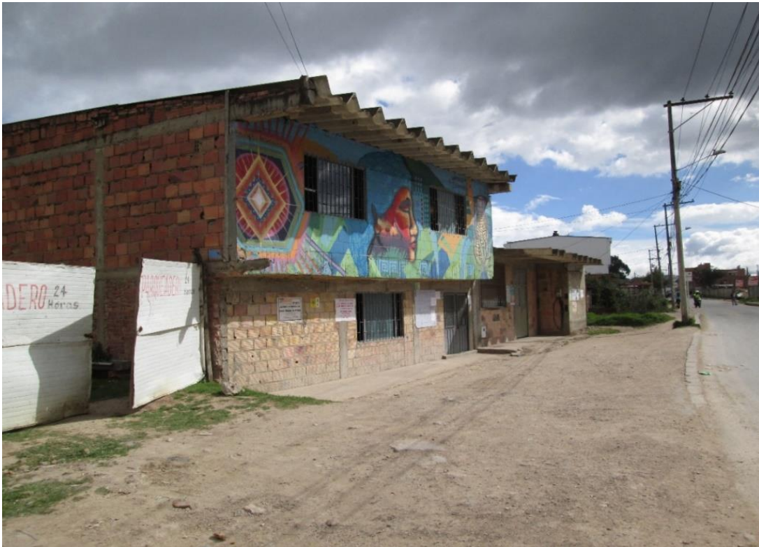
Figure 4: The office of the Muisca group of Bosa.

Most members of the indigenous group still live in San Bernardino, San Jose, or Villa Celina, all illegally built neighborhoods located on what should be, according to official maps, open grasslands and farms alongside the river. The remaining members live in central Bosa, an area less impacted by institutional abandonment. Currently, the Muisca share these neighborhoods with mestizo Bogotans who acquired some of the land plots without following legal procedures, and with other illegal occupants who live in temporary shelters such as broken cars, tents, or old prefabricated houses. During my short walk from the bus stop to the group's office, I encountered several people who seemed to be internal migrants from other regions of