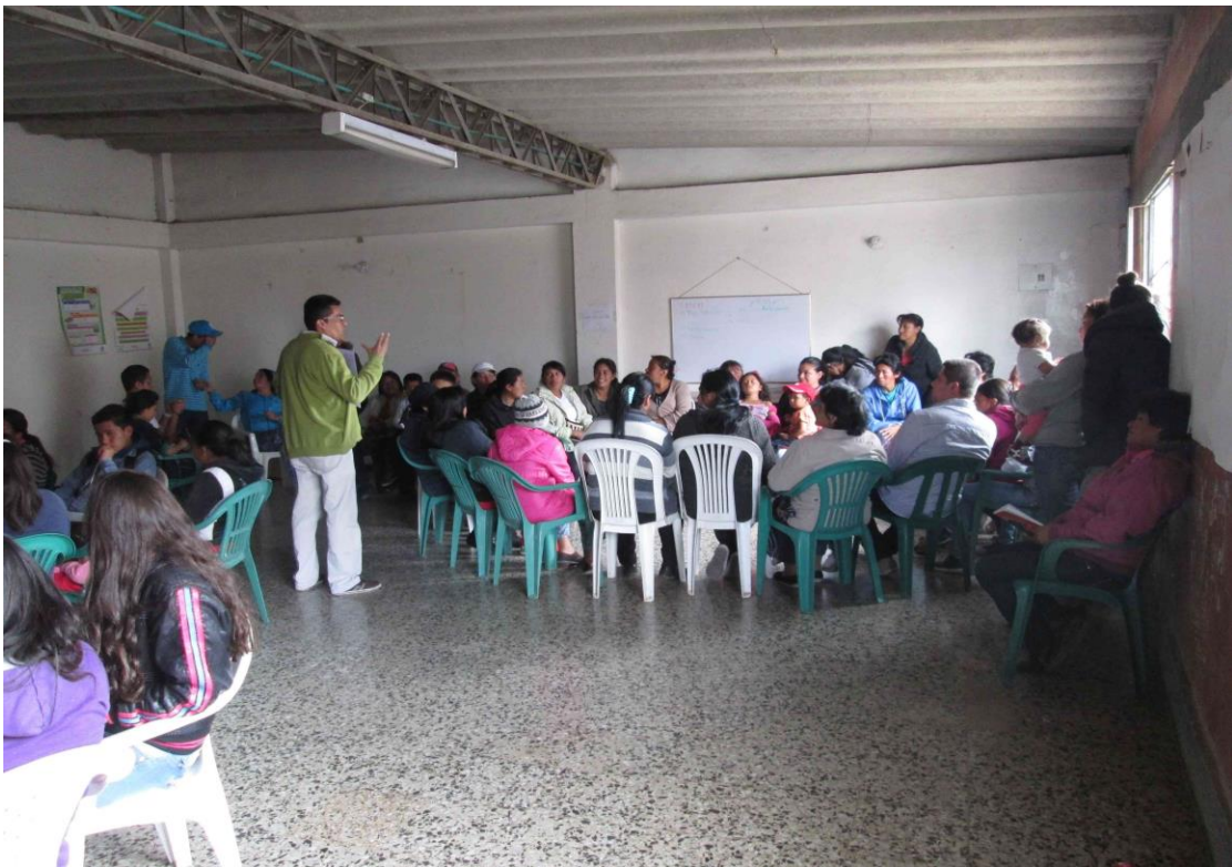
Figure 8: Group members participating in a workshop.

this workshop was due to the fact that it was the only one not taught in a classroom environment but as a practicum in which member's previous knowledge of medicinal plants was taken into account. The other workshops were run by group members educated in Western universities and by non-indigenous volunteers using school books, their own experience, and online materials as their main guidance, keeping the members passive recipients of information (figure 8).