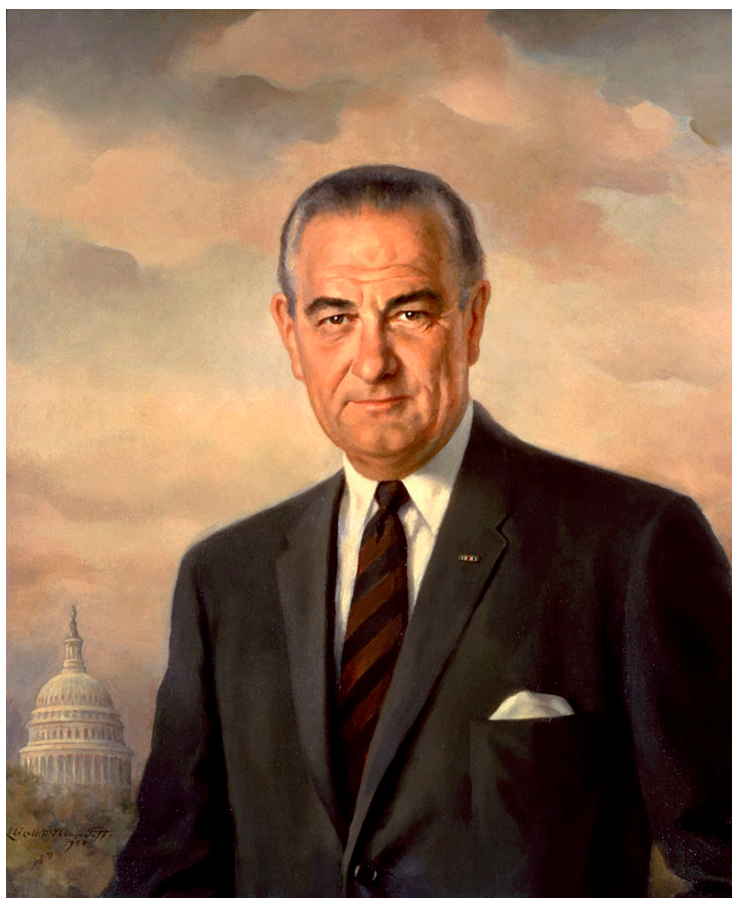
President Johnson’s official White House portrait.