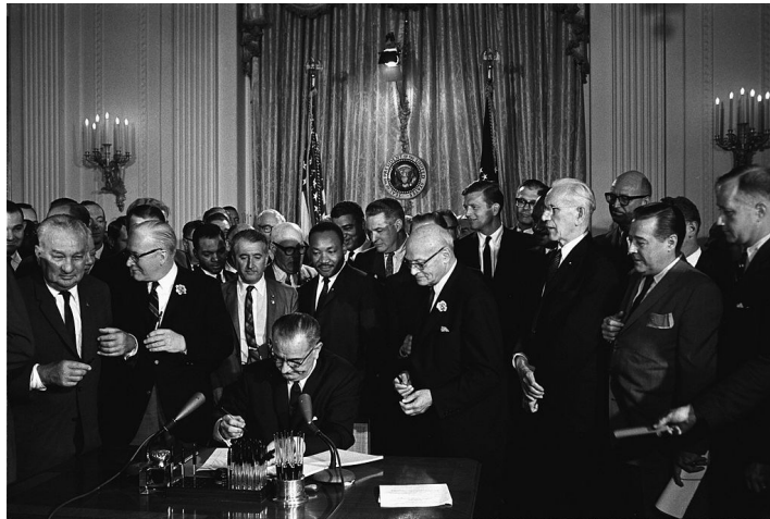
President Johnson signing the Civil Rights Act of 1964.