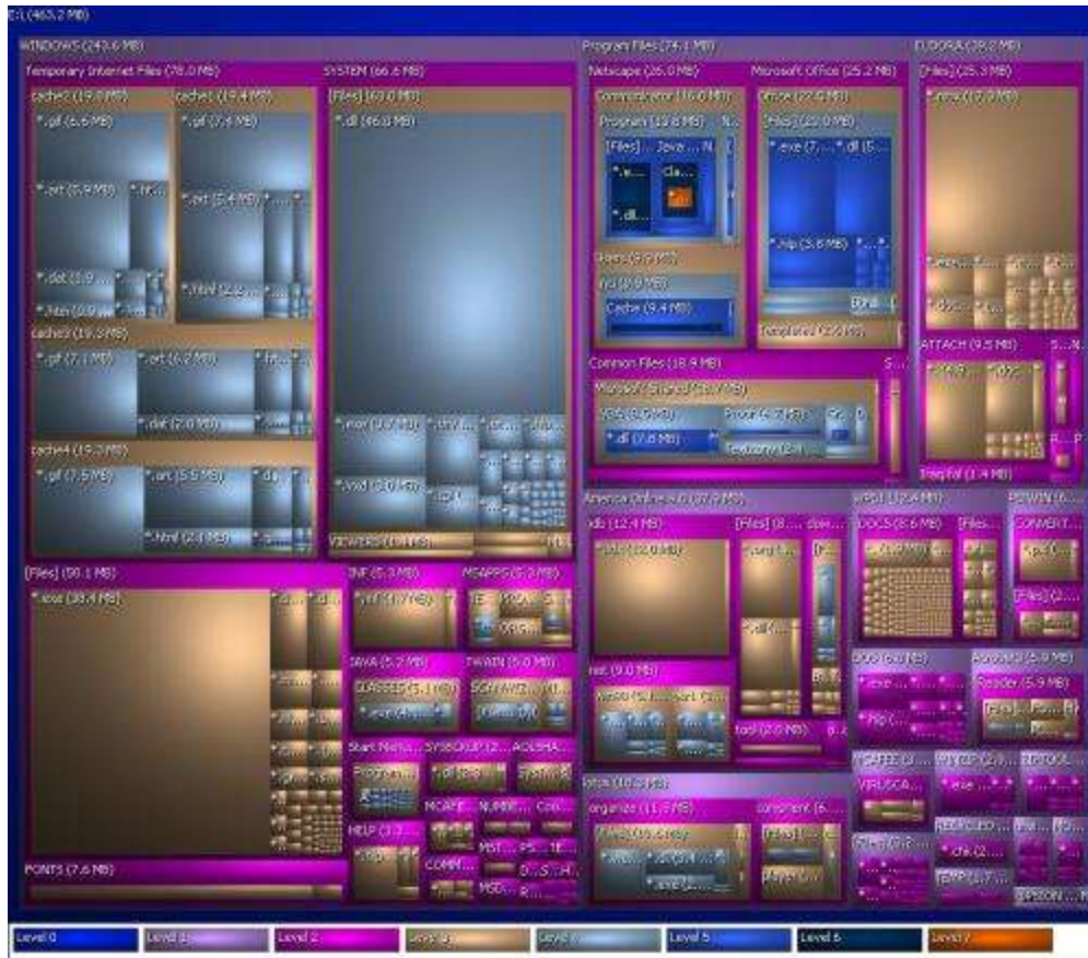
Figure 3: Tree map of NCI 3 generated by TreeSize Professional, exported by the program as a .png image. This tree map is an example of TreeSize's "3D" mode; there is also an option to export the tree map from the "2D" mode.