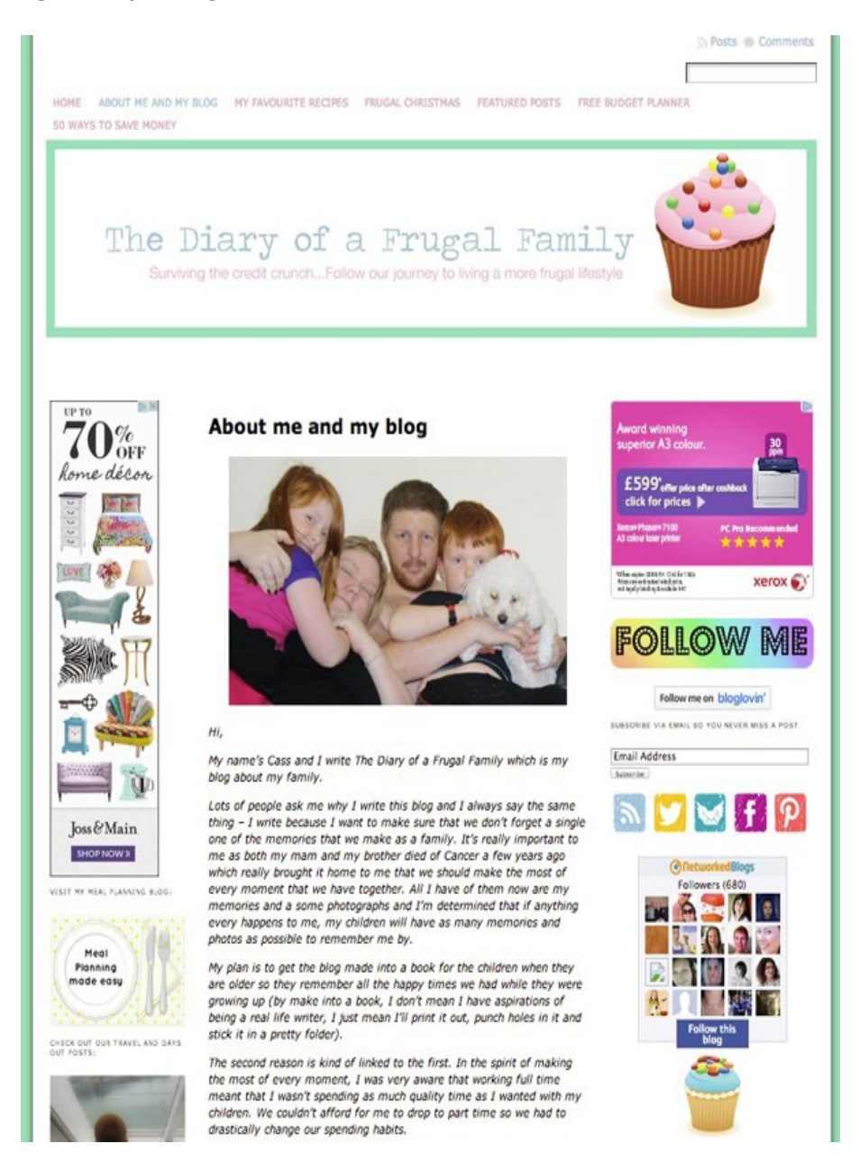
Illustration 1: Image and strapline of Diary of a Frugal Family [25]

The Diary of a Frugal Family blog seems, even on the About Me page, predominantly writing-driven. Writing and image tell similar stories, but also some different ones. Both the title and the strapline, for instance, reference living through scarcity of economic resources ("frugal," the "credit crunch"), as does one of the "why I blog" stories on the page, which describes saving money and trying to clear debt in order to be able to work fewer hours and spend more time with family. Many of the blog posts also describe "credit crunch" strategies for