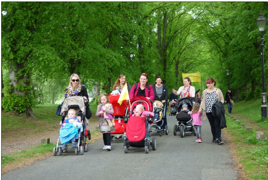
Figure 7: Perambulator Parade, Huntly, 2014

This connects onwards to the project post-Huntly. Writing about and talking about the work has been its continuation so far, enabling me to think extensively about its core ideas. Through this writing and talking new opportunities for doing and making are starting to emerge, prompting me to consider how a project can ebb