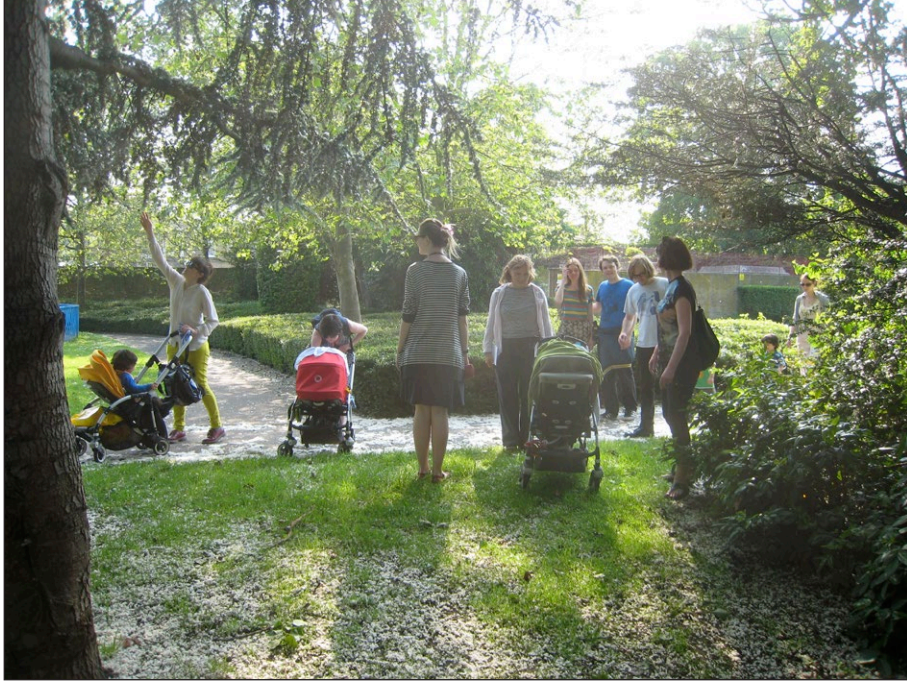
Figure 3: Perambulator, Lewisham, 2012