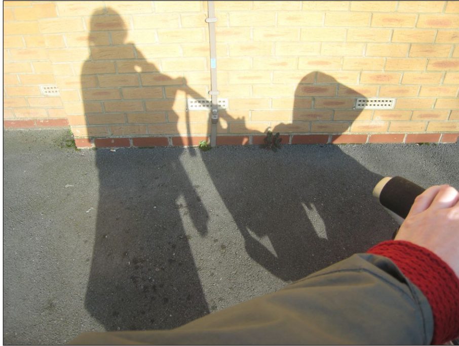
Figure 1: Pram Shadow , walking self portrait, 2012.

Viewing the city through this new lens feels political. Losing the freedom of easy mobility – a freedom that I hadn't been aware of before – connects me to a massive group of people (predominantly women) in the same position, encumbered by wheels. This became the premise for Perambulator – making this visible through a mass walking with prams. So, simply, pram users were invited to meet at the gallery, and go for a walk around the neighbourhood.