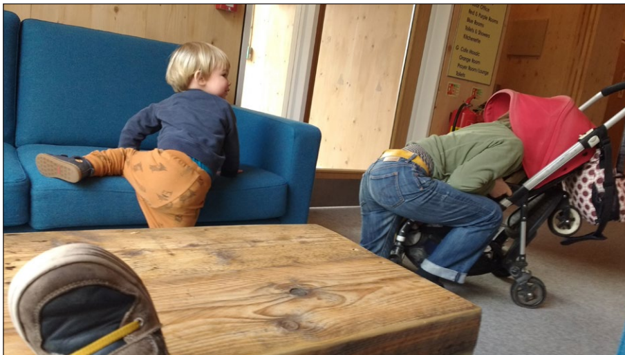
Figure 9: Pram Nap , self portrait, 2015.

and flow, shifting scales in different phases. So the activism at the project's heart swings from a shift in personal viewpoint – reframing life in relation to art, reflecting on mobilities and life transitions – borders, boundaries and obstacles and how they might be overcome. Becoming now a collaborative project with my slightly older