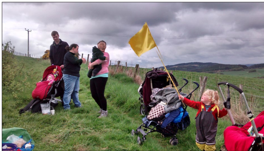
Figure 5: Baby Slow Marathon, Huntly, 2014, image: Clare Qualmann.

As the project progressed people told me about the horrors of navigating the pavements on bin day, about forest walks they used to do before they had kids, about different approaches to walking-for-napping. I took a large map into play-group and asked people to mark awkward spots, narrow pavements, steep steps, slippery surfaces. This process helped to shape plans for the Perambulator Parade ,