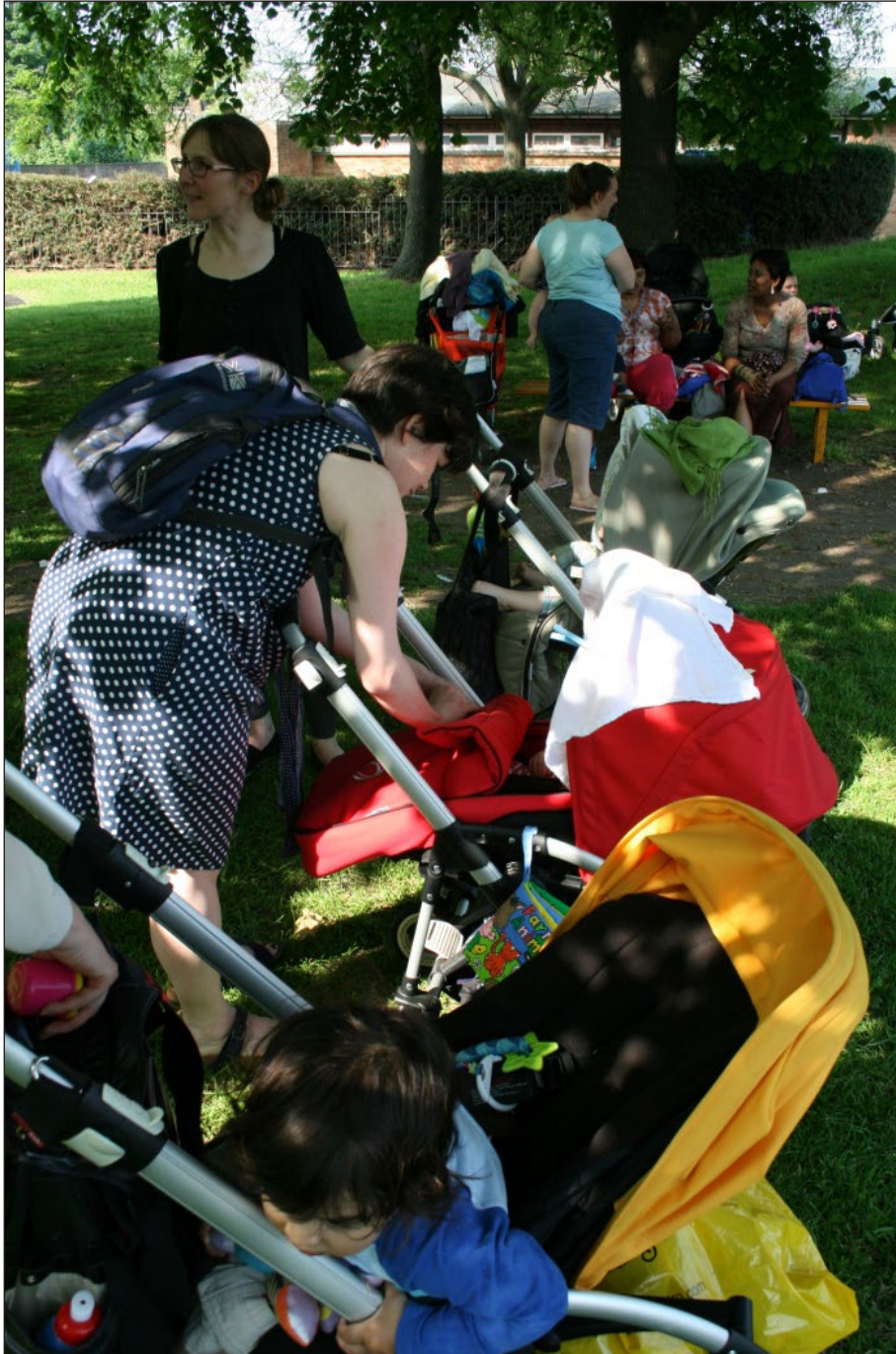
Figure 2: Perambulator , Lewisham, 2012, image Candida Powell-Williams.