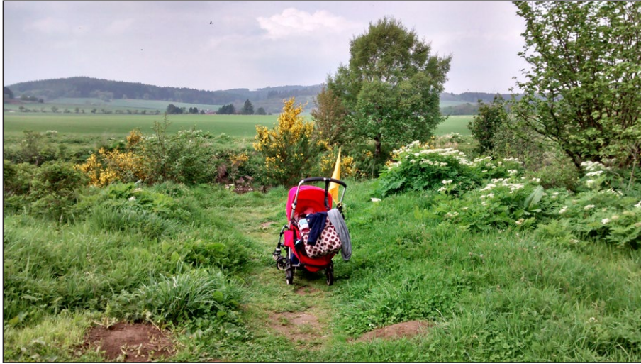
Figure 8: By the River Deveron, Huntly, 2014 , image Clare Qualmann.