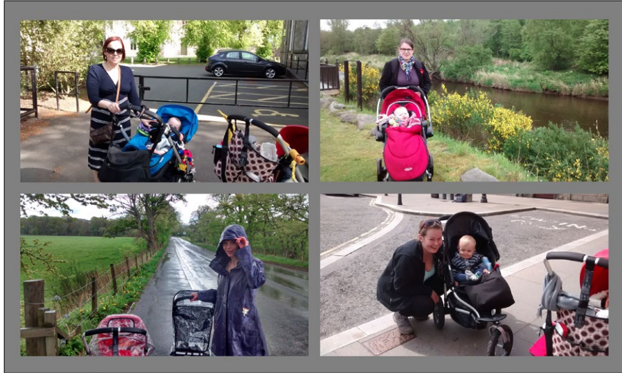
Figure 4: Pram Walks, Huntly, 2014, image: Clare Qualmann.