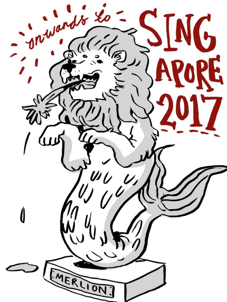
Image 6. Scriberia image of Singapore conference.