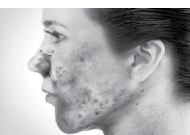
"Drinking a lot more than two small