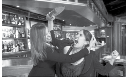
"Drinking immoderately in social situations means that you are more likely to make bad interpersonal choices and behave in an undignified manner."