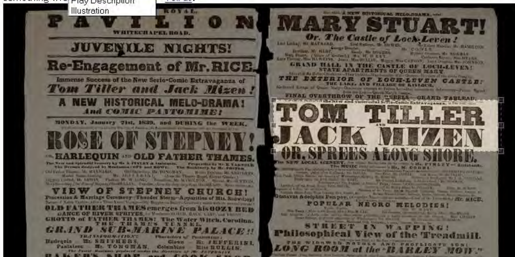
Figure 4. Bossa's image cutter

Feature Type: submit Can't see any features? - Click DONE Notice anything? comment (optional) Something wrong? Tell us.