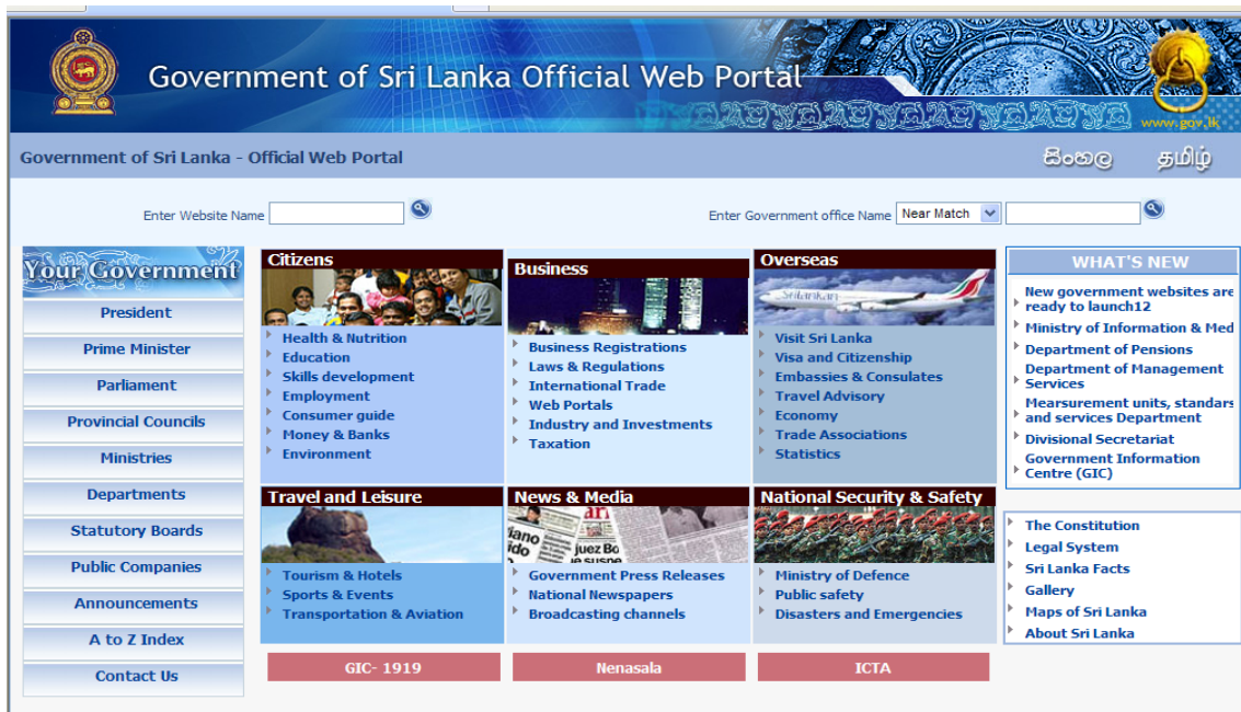
Figure 1: The home page of Government web portal of Sri Lanka

The evaluation was carried out based on each axis of evaluation framework. In addition home page, department page, Sri Lanka fact page and A to Z page of official web portal were used as sample for this evaluation. Figure 1 illustrates the home page of Government web portal of Sri Lanka ( www.gov.lk ).