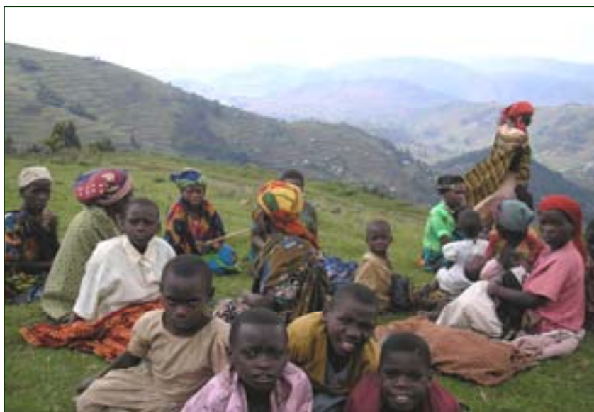
Community meeting, Murubindi, Uganda.

The Bwindi, Mgahinga and Echuya forests in south-western Uganda were gazetted as forest reserves by the British in the 1930s. This effectively protected them from being destroyed by the agriculturalists who had moved into the area formerly inhabited only by the Batwa, while allowing the Batwa to continue to make use of them. However, since Bwindi and Mgahinga became national parks in 1991, Batwa exclusion has been