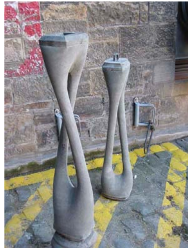
Remo Pedreschi has researched how a new architectural 'language' of sensual fluid forms could emerge from flexible formwork

The wide variety of column-section shapes produced in Remo Pedreschi's workshop at Edinburgh University, where he is a professor, is the result of manipulating the hydrostatic pressure of wet concrete. The formwork, which consists of stretched and twisted fabric tubes, produces figure-of-eight-shaped forms, hollow columns and columns with voids. To connect the various elements, Pedreschi developed interlocking male and female components. A vacuum-formed mould was incorporated into the ends of the formwork to ensure geometric accuracy. Independent of the columns, the prototype connection can be used in other components.