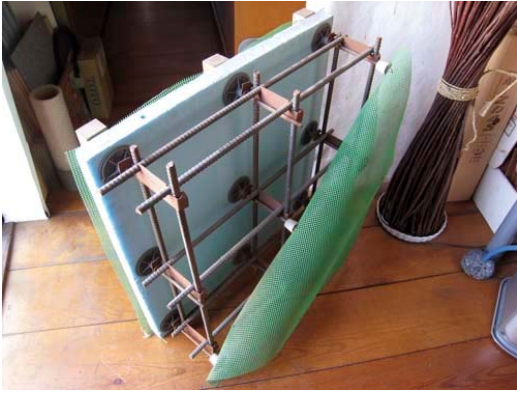
Kenzo Unno's 'zero-waste' formwork

Unno's 'zero-waste' formwork uses a reinforcement cage to support the fabric, so bracing and propping elements are not required. For insulated construction, the fabric, together with rigid polystyrene insulation boards, forms the shuttering. Furring strips – long, thin strips of wood or metal – are used as support, and remain in place after the concrete is formed to provide fixing points for cladding. After use, the fabric, a woven polypropylene geotextile, can be washed and used again.