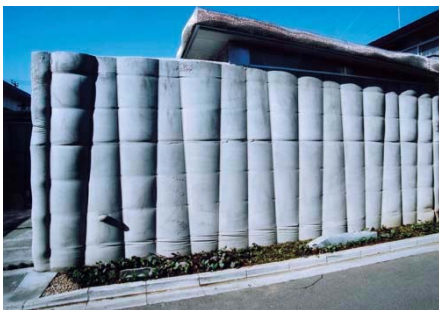
Stone Renaissance House, Funabashi City, Japan, by Kenzo Unno of Umi Architectural Atelier

For Tokyo-based firm Umi Architectural Atelier's Stone Renaissance House, concrete formwork was created using the 'frame restraint' method, developed by the practice's Kenzo Unno. Netting is stretched along the inside of steel pipes, restrained by standard form ties running through holes drilled in the pipes. Concrete is poured in and, when the walls set, the restraining pipes are removed, leaving a vertical impression. For this project Unno experimented with a diagonal pattern.