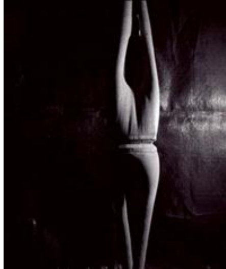
Concrete column by students at Edinburgh University made using flexible formwork

Interest in the technology is growing – a conference organised by the International Society of Fabric Formers was held in Manitoba, Canada, in May. Fabric formwork technology is actually very old – rammed earth within hessian sheets was first used 2,000 years ago. But a new generation of designers is reinventing it as a sustainable construction method for the 21st century – the work of three of them is introduced here.