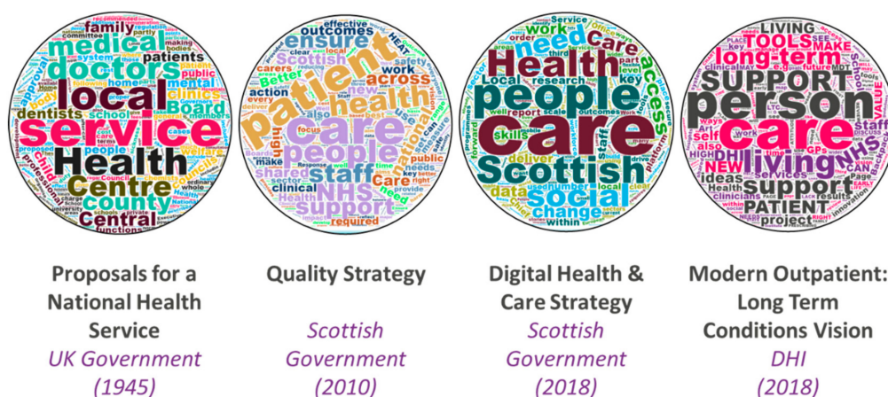
Figure 1. Visualizing the shifts in language in Scottish health and social care policy [4,11–13].

However, these benefits will not manifest if resources continue to focus on transactional relationships between citizens and health and social care systems. This is because in order to personalize and predict, systems must be informed by the person's own context. Therefore, it is proposed that the digital health and social care toolset must help systems by understanding people's lived experience. This includes their current health and wellbeing activity, health, and social care interventions in a broader life and environmental context and any resulting holistic outcomes. The toolset must be able to balance the system's need for information with a personal need for trust and the ability to connect to informal care circles and communities. It must be able to use any formal or informal assets to help sustain the engagement, care interactions, and experiences on a co-managed basis.