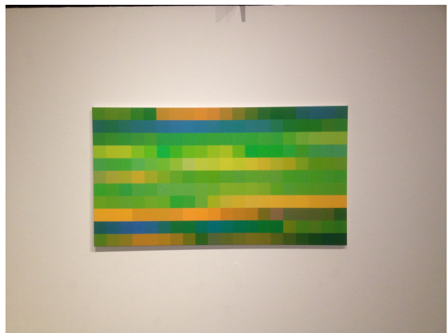
Figure 2. Artwork made from speed, altitude and heart rate data.

Large and small wall mounted artworks printed on canvases constructed from coloured squares arranged sequentially from left to right and top to bottom, representing the sequence of GPS points for discrete parts of the trails ridden. The colour of the squares is determined by the mixing of RGB colour channels in Processing that converted speed, altitude and heart rate into usable data and mapped it to the RGB colour palette (Figure 2).