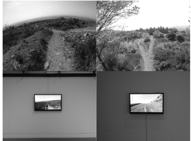
Figure 1. Photographs and video of landscape taken while riding.

only sampled data can be collected over the full duration of the ride. Thus the experience presented is that of the real place as seen by the camera but presented over the duration experienced by the author. This draws attention to the gap between what is seen on screen and what is not. Significant distances can be travelled in sixty seconds, which if omitted from the visual record gives a skewed view of what the place really looks like, a kind of high fidelity visual image but low fidelity time pixel.