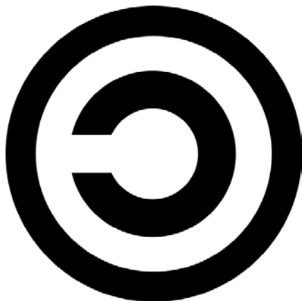
Figure 3: Copy-left Logo