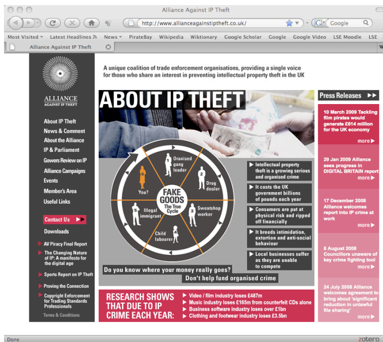
Figure 2: Screenshot of website of the Alliance Against IP Theft